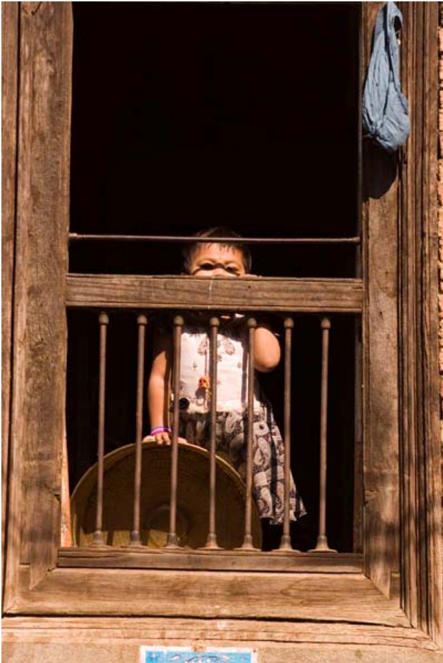
Bungamati, Kathmandu Valley.