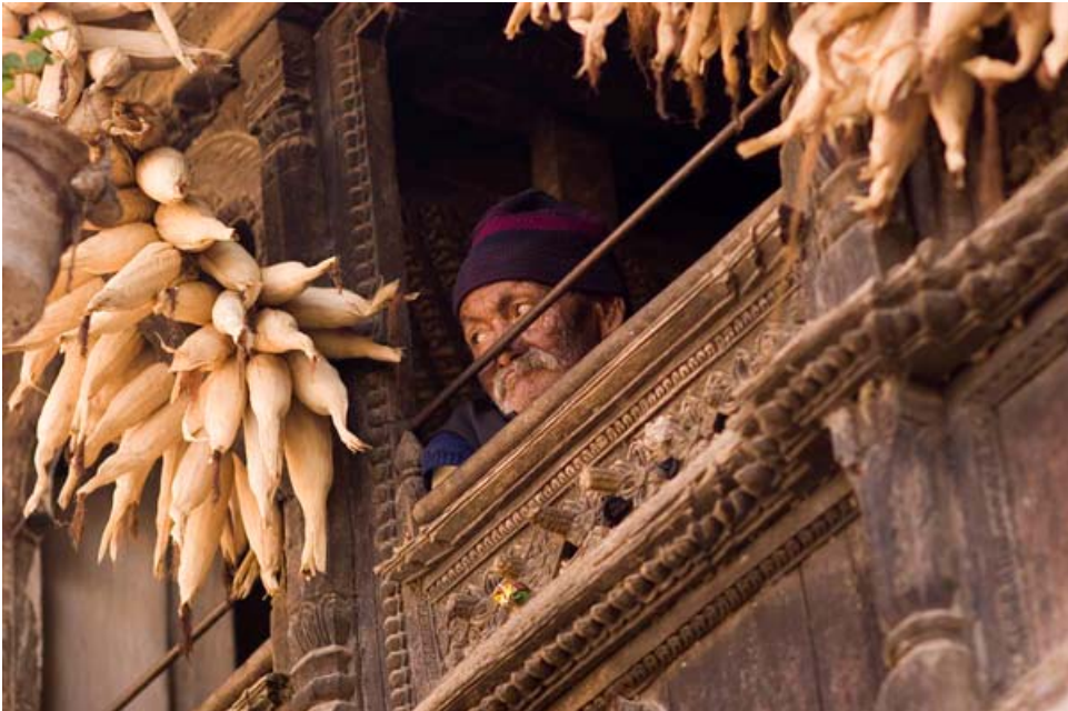
Bungamati, Kathmandu Valley.