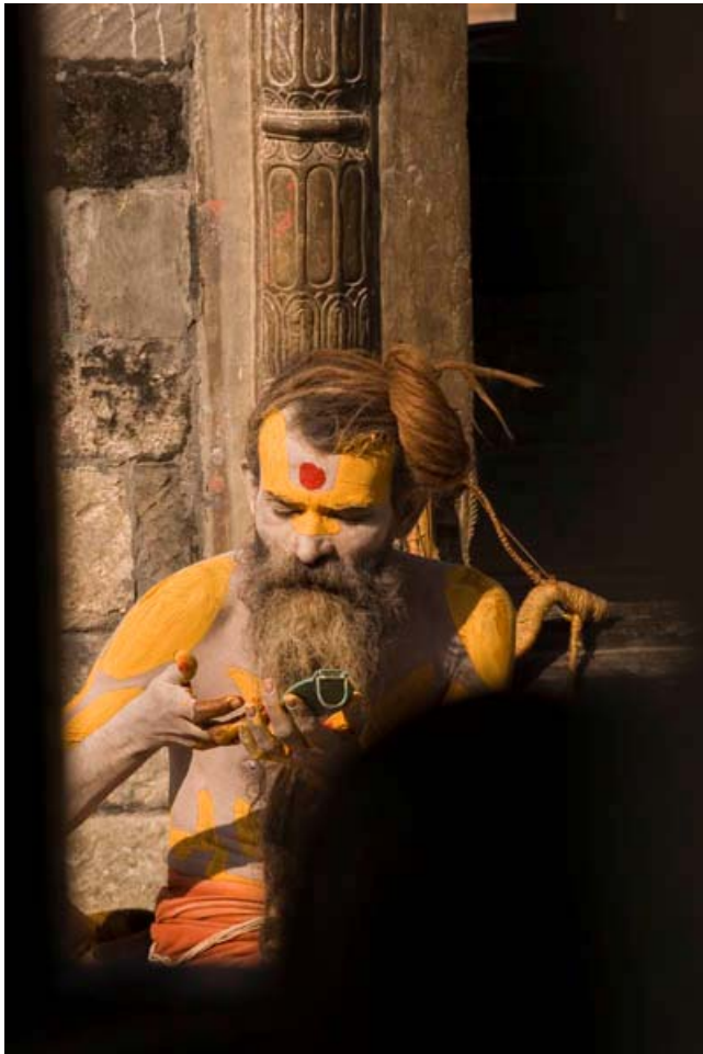
Sadhu, getting “done up,” Pashupatinath, Kathmandu.