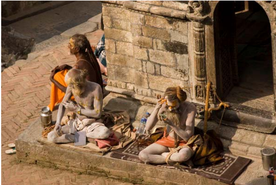
Sadhus getting “done up,” Pashupatinath, Kathmandu.