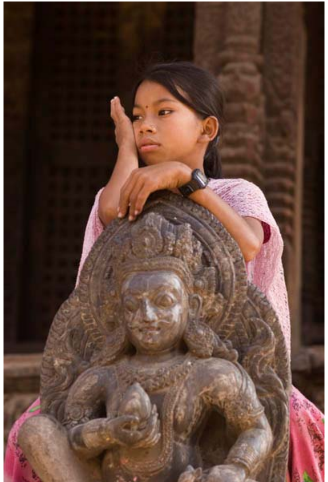
Durbar Square, Patan, Kathmandu Valley.