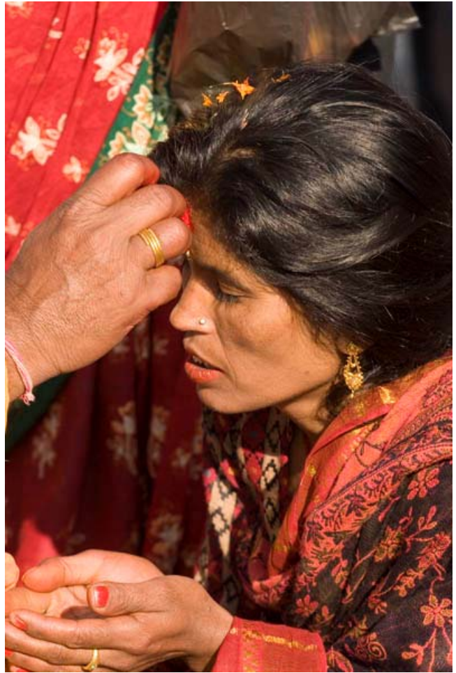
Woman receiving tika, Budhanikantha, Kathmandu Valley.