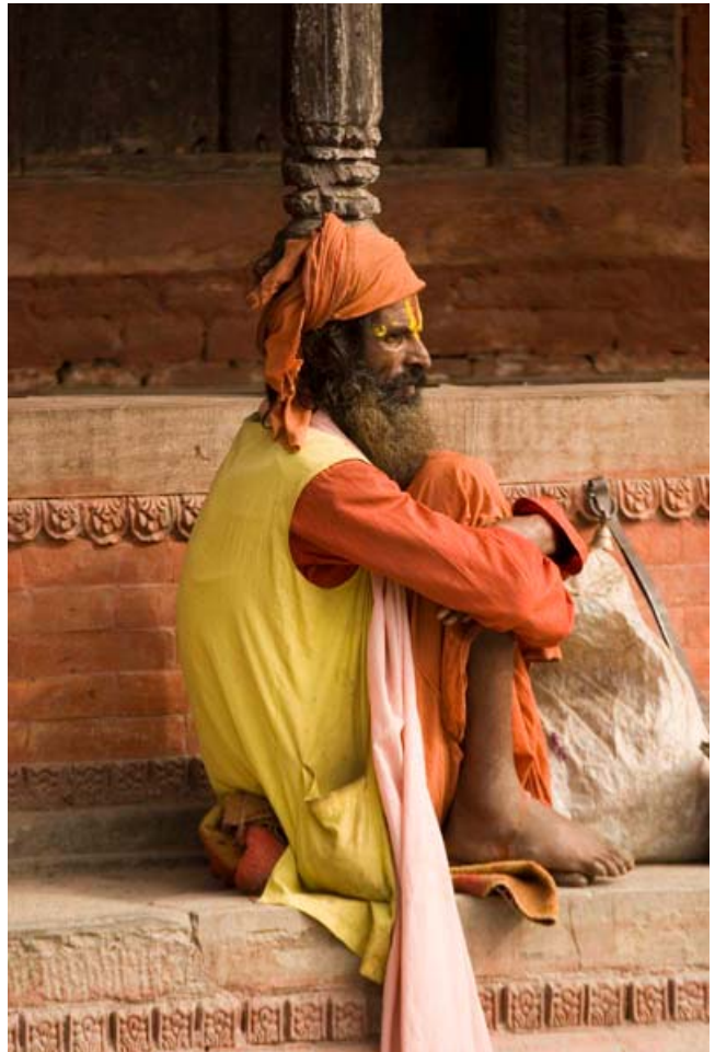
Sadhu, Pashupatinath, Kathmandu.