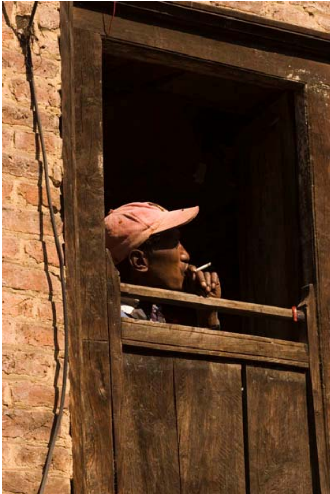
Bungamati, Kathmandu Valley.