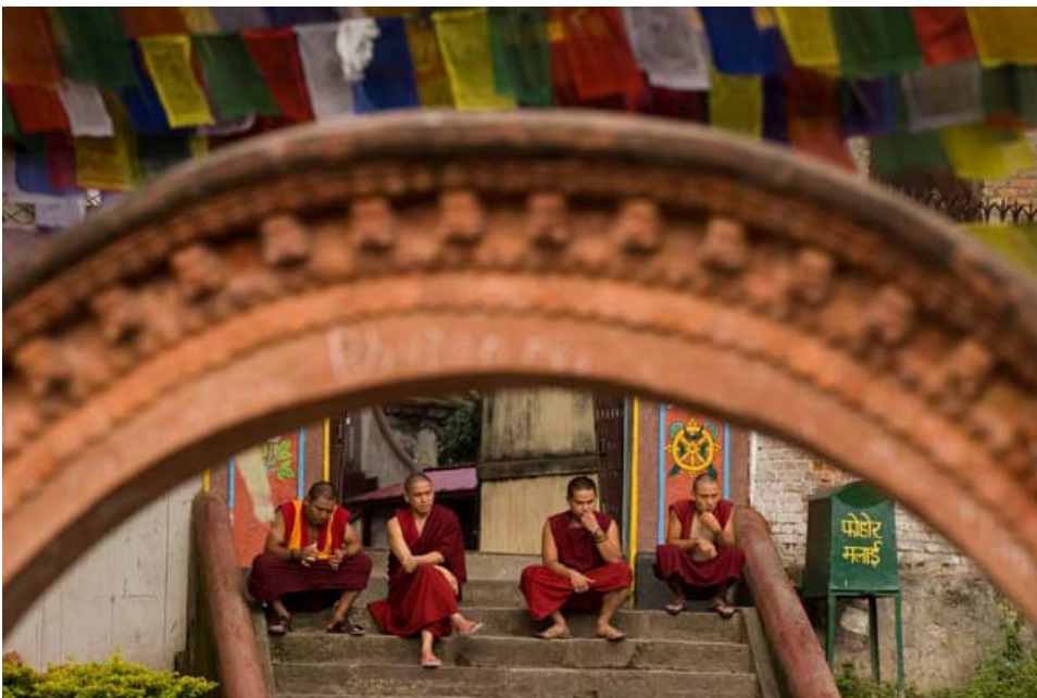
Tibetan monks, Swavambhunath Stupa, Kathmandu