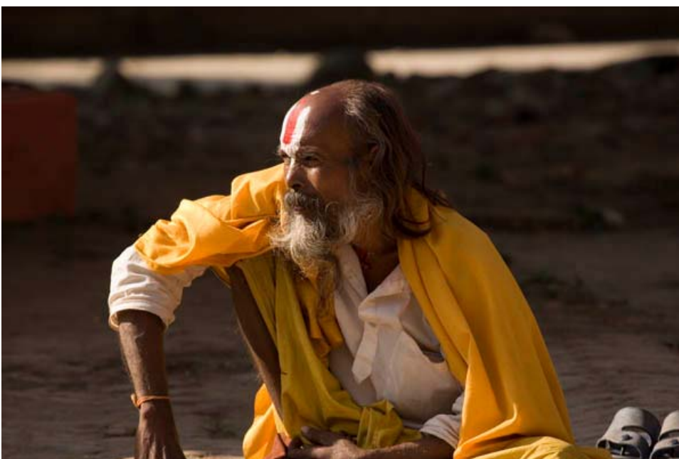
Sadhu, Budhanikantha, Kathmandu Valley.