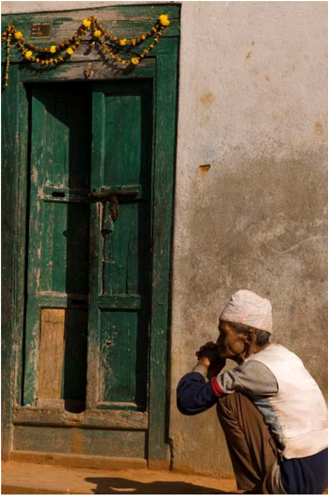
Bungamati, Kathmandu Valley.