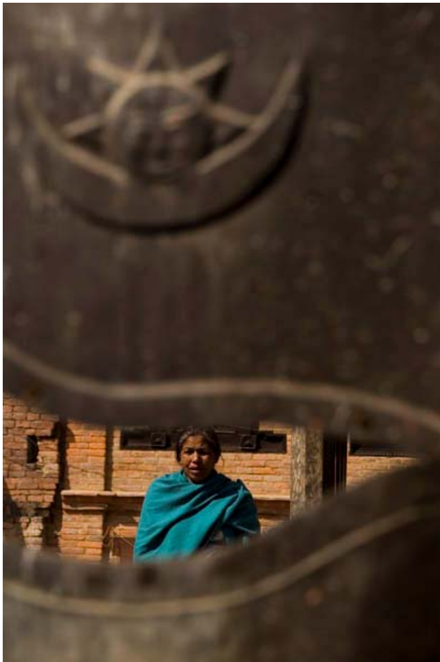
Patan, Kathmandu Valley.