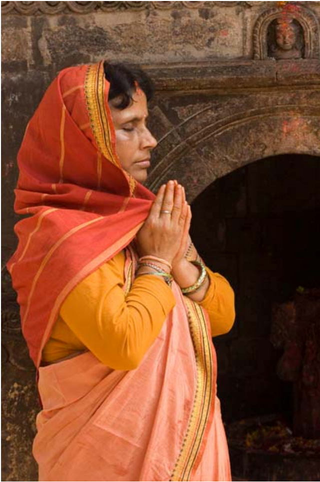
Patan, Kathmandu Valley.