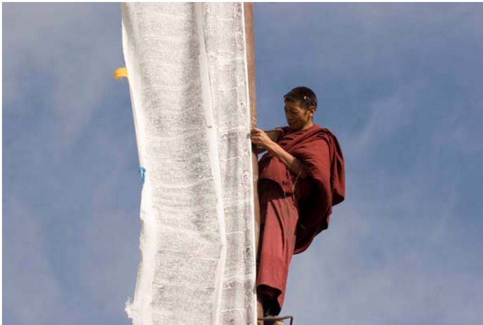
Monk hanging a prayer flag, Langmusi.