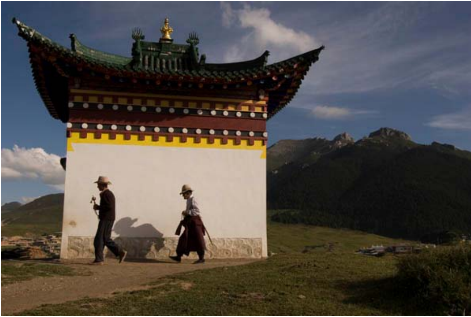
Pilgrims performing kora , circumambulation of a monastery in Langmusi.