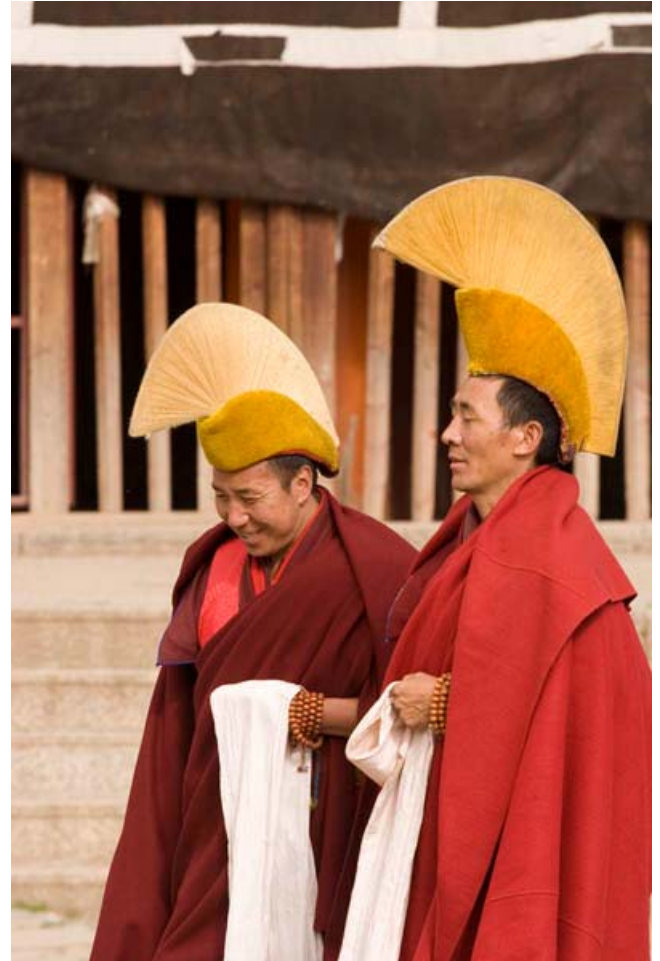
Monks at a monastery in Langmusi.

My time in Langmusi was spent hiking and visiting the monasteries at a leisurely pace. My first day in town the weather did not cooperate and I abandon my hike after the trail rose in to the clouds, and I was struggling upwards with nothing to see except the white cloud of mists that surrounded me. The second day my luck with the weather was much better and after catching the tail end of the monk debates at the monastery I climbed one of the mountains overlooking the town for a spectacular 360 degree view of the surrounding mountains, grasslands, and gorges.