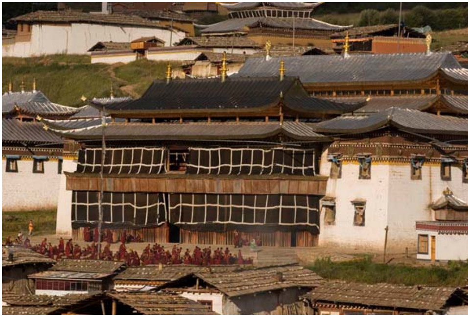
Monks debating in front of the main prayer hall at a monastery in Langmusi.