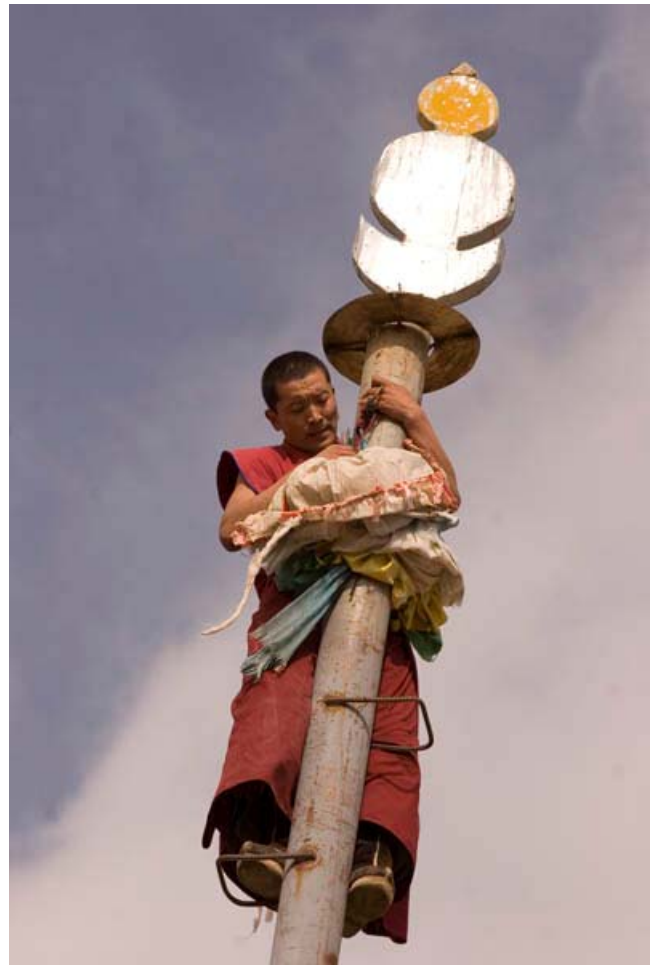
Monk hanging a prayer flag, Langmusi.