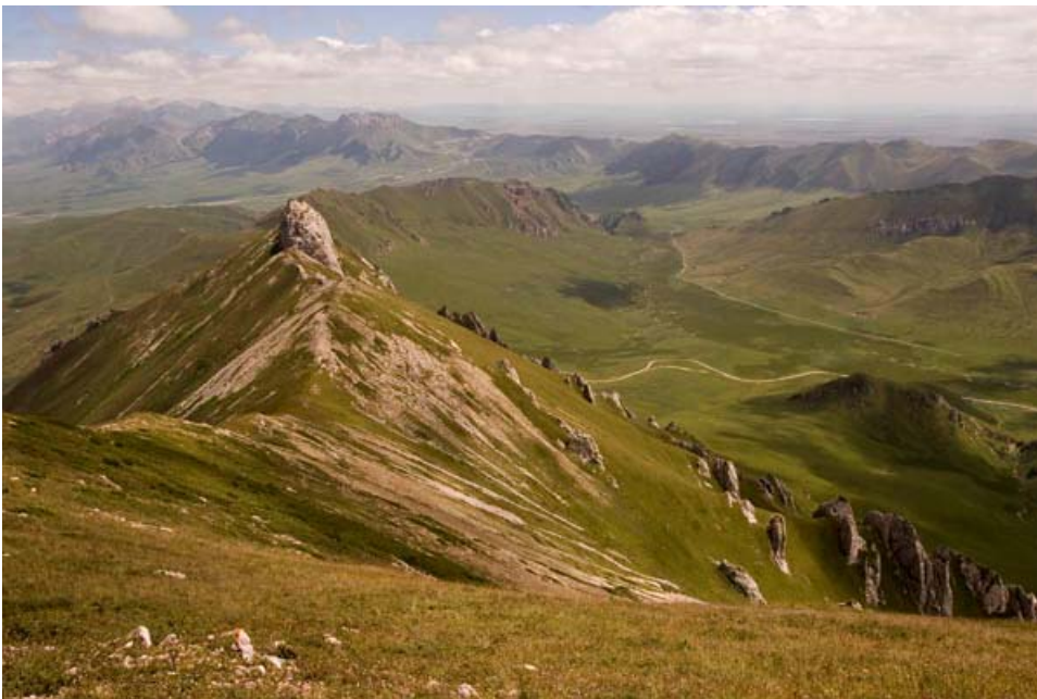
View from the top of the peak I climbed near Langmusi.