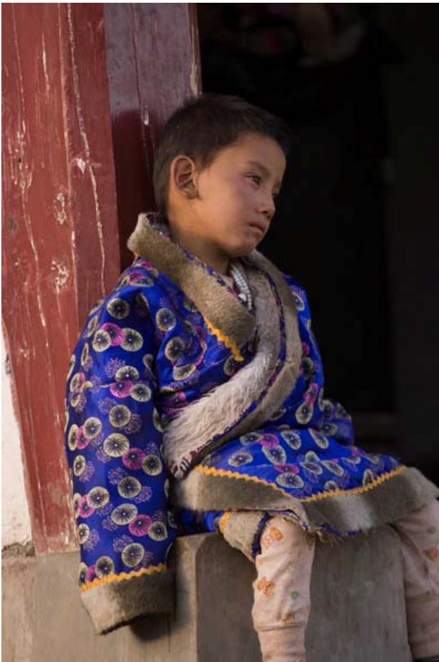
Boy waits for his mother to finish turning prayer wheels at a monastery in Langmusi.