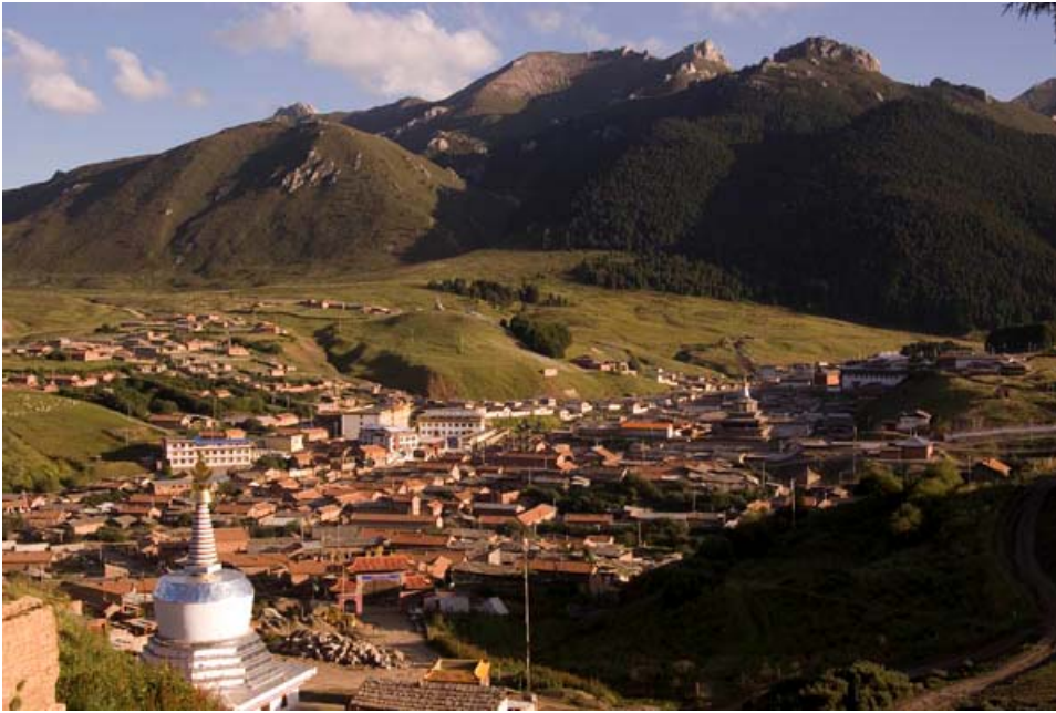
View of Langmusi the mountain in the back is the one I climbed. Langmusi is at 3300 m (~10,900 ft) so I'm guessing the peak was somewhat over 4000 m (maybe ~14,000 ft)