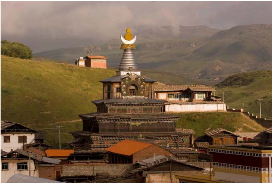
Stupa at a monastery in Langmusi.