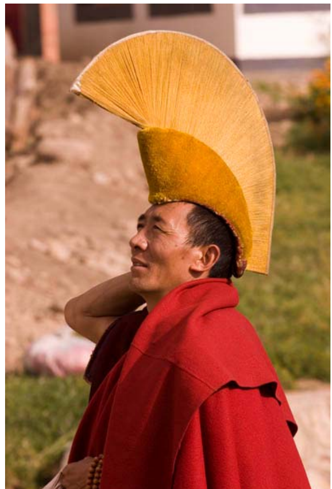
Monk watching the prayer flag hanging, Langmusi.