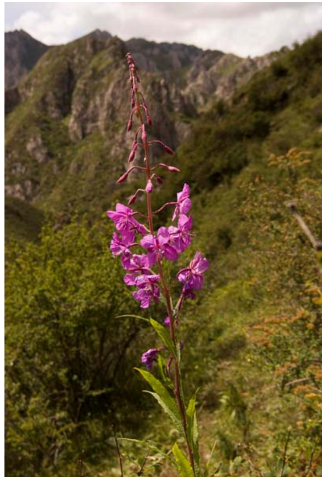
Wildflower near Langmusi.