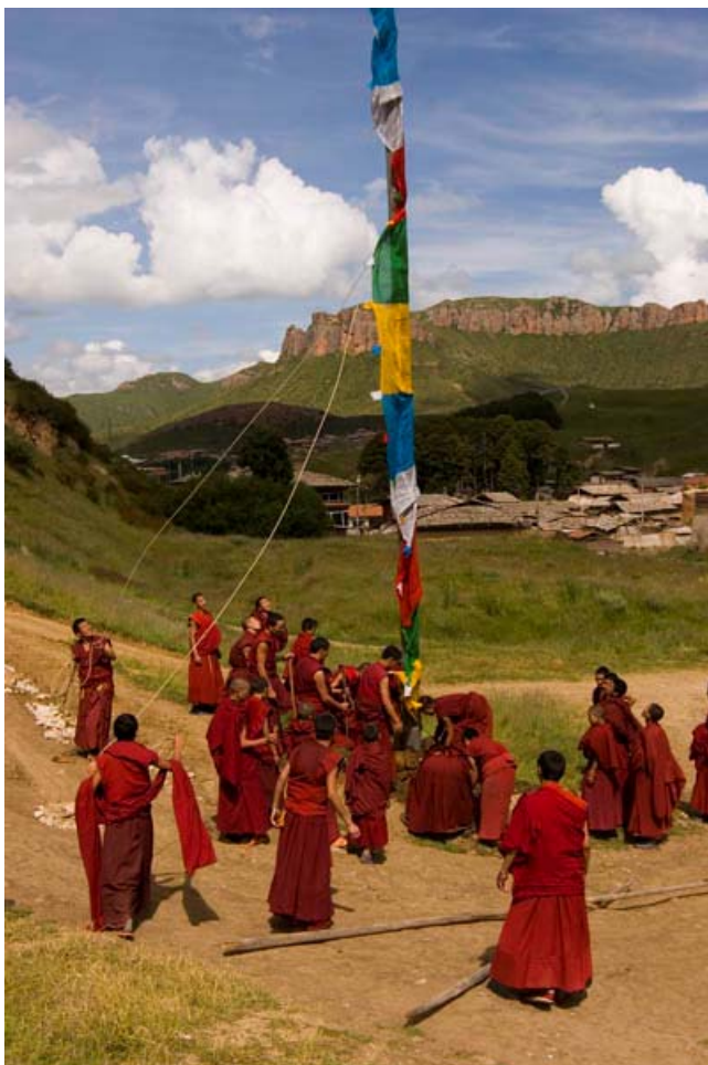
Monks raising another prayer flag. It must have been prayer flag hanging day in Langmusi.