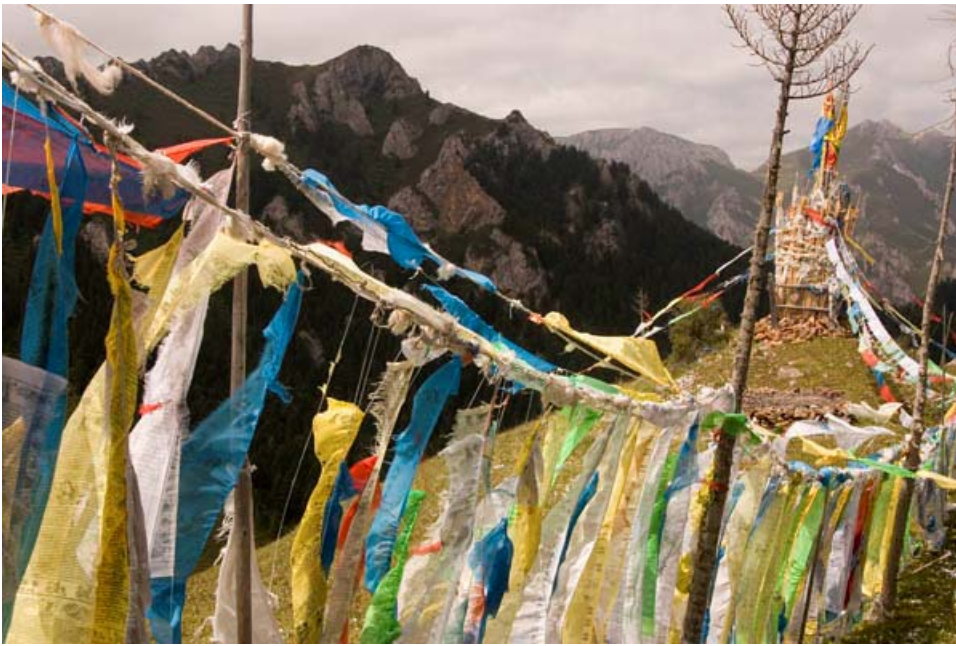
Prayer flags above Langmusi.