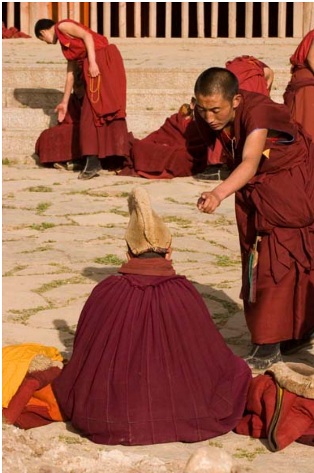
Monks debating, Langmusi.