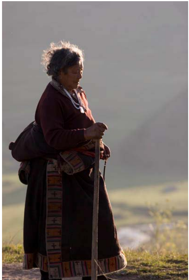
Woman making her kora , circumambulation, around a monastery in Langmusi.