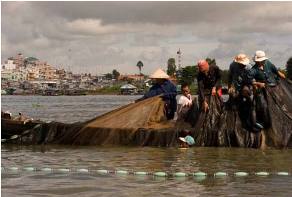
Pulling up the fishing net with Chau Doc in the background.