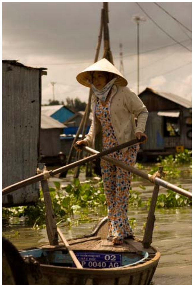
All the cycle taxis are men but the row boat taxis are always women.