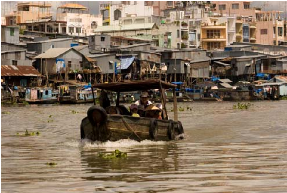
View of Chau Doc from the river.

For those who cross from Cambodia to Vietnam by boat via the mighty Mekong, their first impressions of Vietnam are formed in Chau Doc a delta town just across the boarder from Cambodia, although as the river flows it's a scenic two and a half hour boat trip from the boarder. The vibrant colors of the delta are a stark contrast to the more muted colors across the boarder in Cambodia. The place has almost a Mediterranean feel to it with buildings nicely painted in bright pastel colors, Catholic churches, and Mosques. It's a cosmopolitan area, vibrating with life centered about the many rivers and canals that crisscross the region. The markets are full of activity and color abundant with photo opportunities.