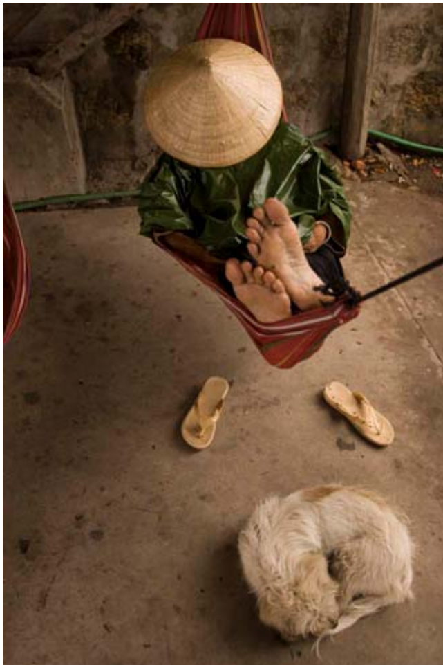
Woman and dog waiting for the rain to stop, Sam Mountain near Chau Doc.