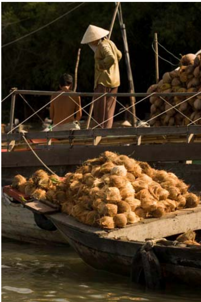
Boat full of coconuts river near Chau Doc.