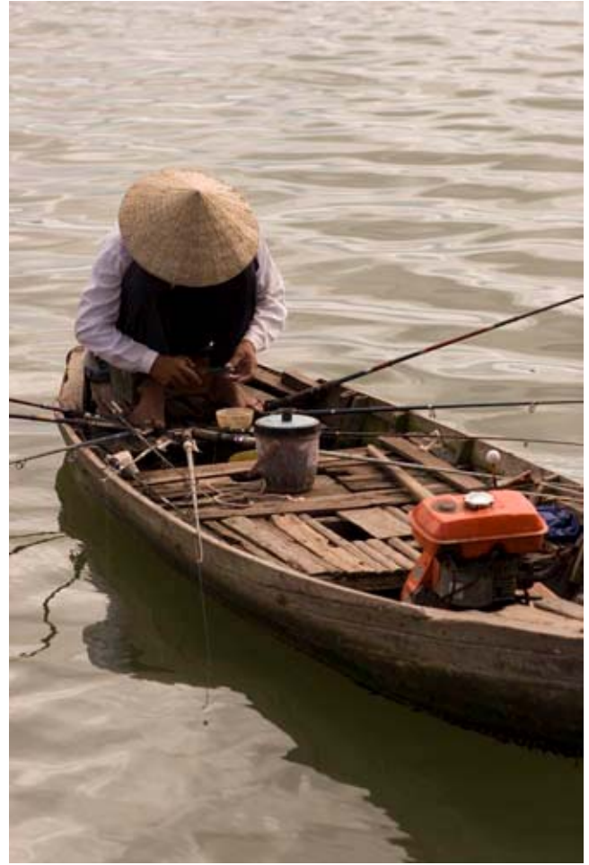
Man fishing with multiple poles, river near Chau Doc.