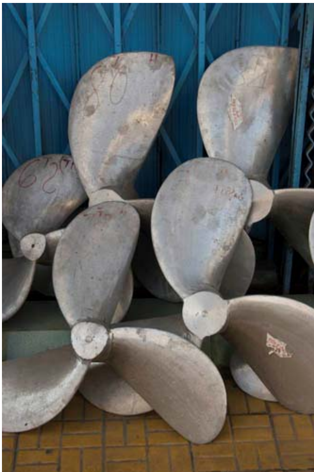
Propellers on sale at the market in Chau Doc.

If you are having a bowl of pig brains make sure you pick out the flies.