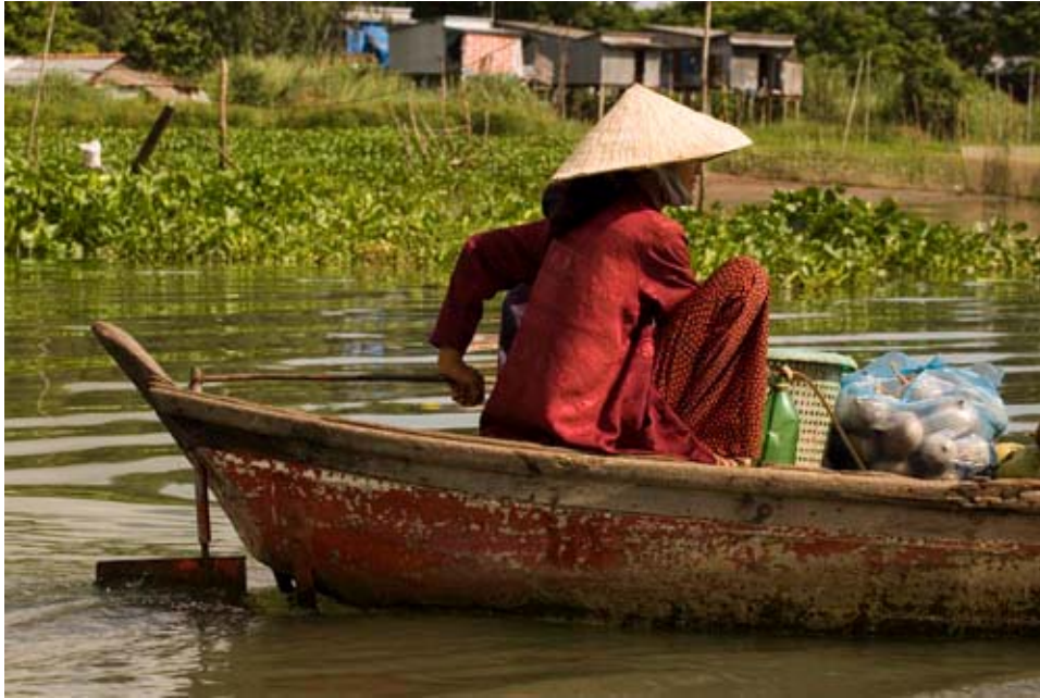
Life on the river.