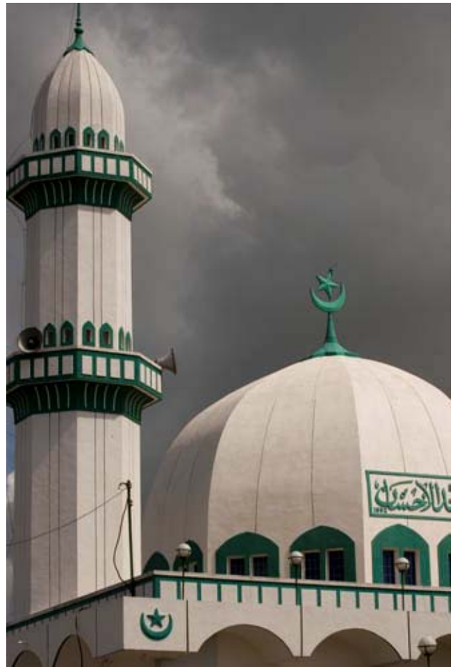
New Cham mosque in a village near Chau Doc. The Cham are a Muslim minority group in the delta.