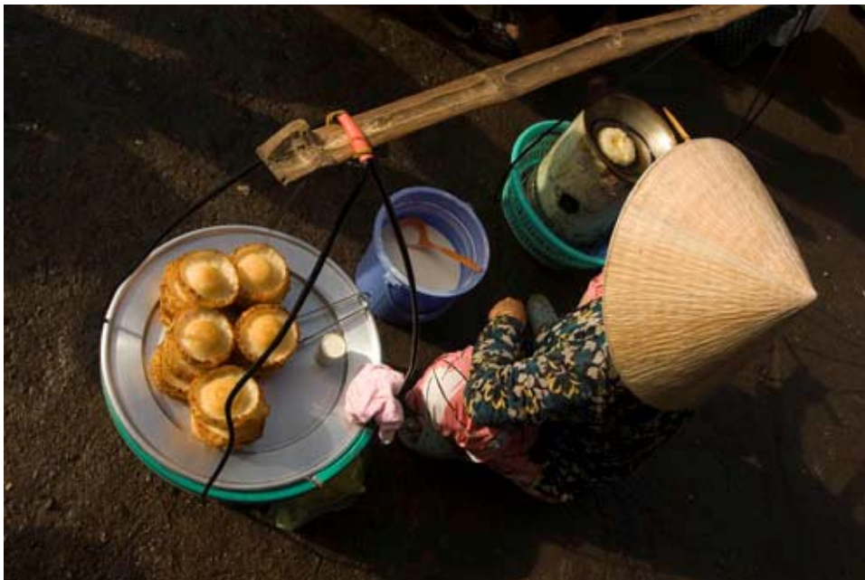
Street vendor, Chau Doc.