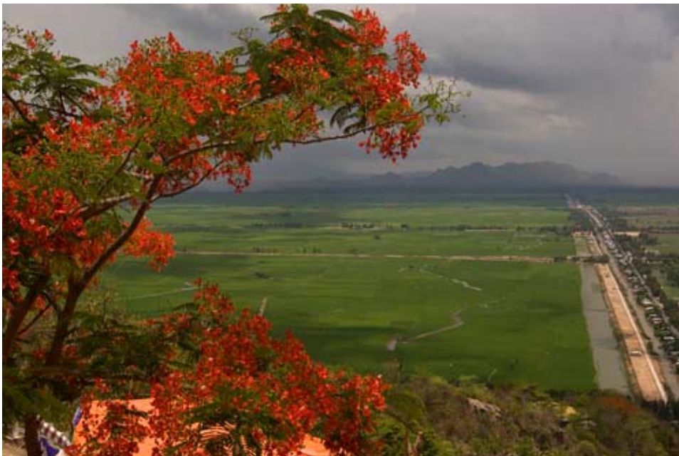
View from Sam Mountain towards Cambodia near Chau Doc.