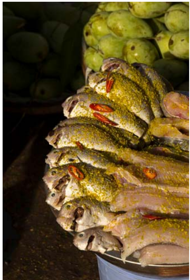
Fish and mangos at the market in Chau Doc.