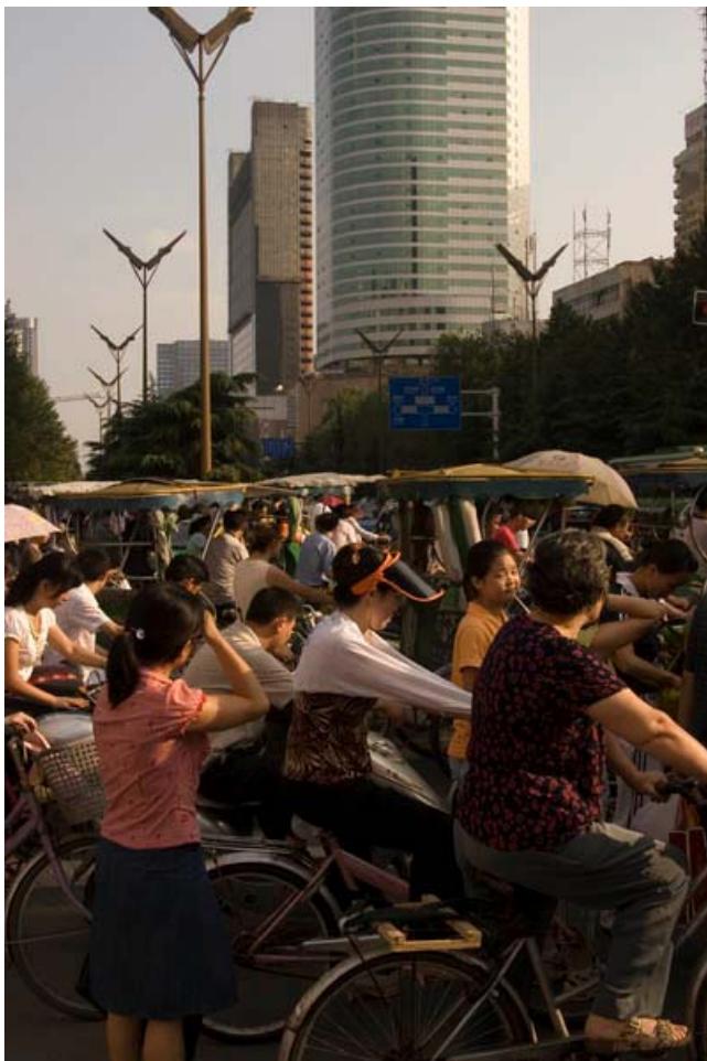
Traffic waiting to cross on a street in Chengdu.

I couldn't believe this sequence of stores when I was walking around downtown Chengdu. I made double take then I had to take a picture. Santa Barbara Polo & Racquet Club next to a Playboy store which sells men's clothing. These were definitely not there when I was last in Chengdu 8 years ago.