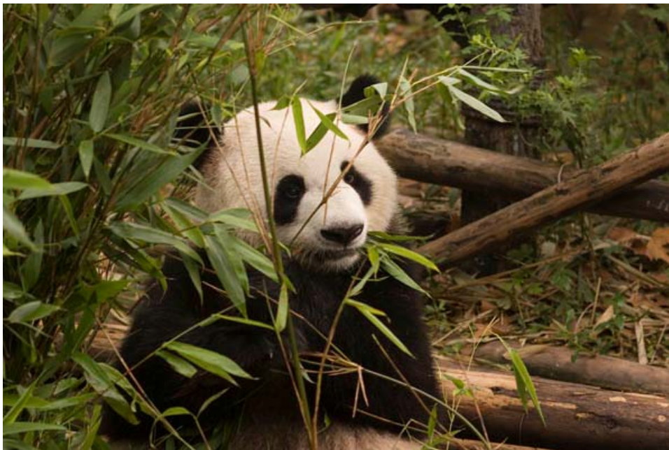
Giant Panda at the Panda research base, Chengdu.