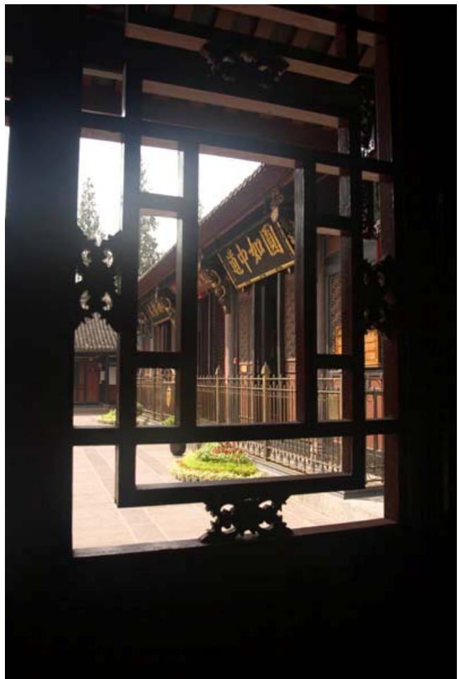
Wenshu Temple, Chengdu.