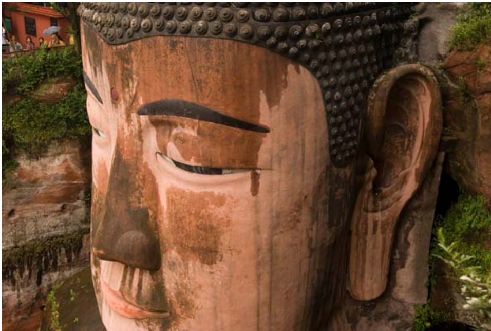
Head of the Grand Buddha, Leshan (people in the top left corner for scale), Chengdu.