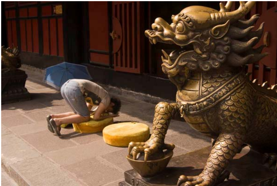
Woman kneeling at the Wenshu Temple, Chengdu.