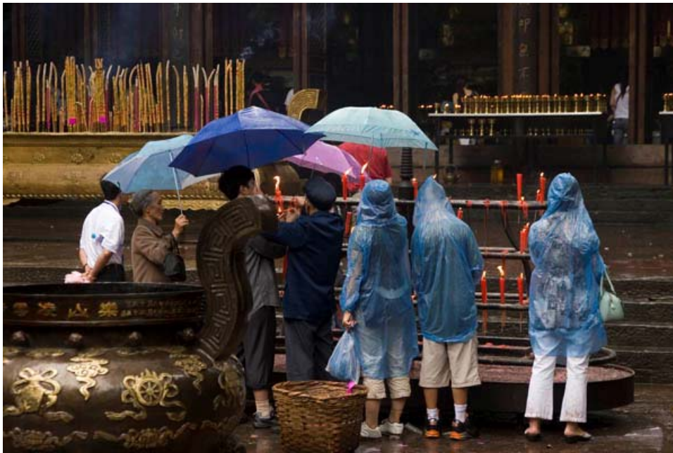
Lighting candles at the Dafo temple adjacent to the Grand Buddha, Leshan.