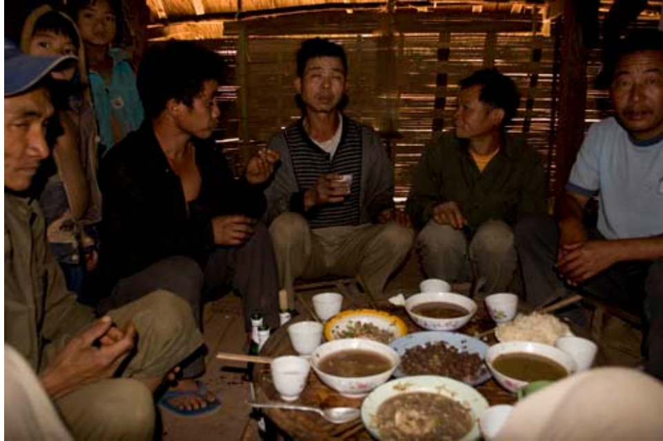
The meal that did me in. I should have taken a hint from the middle guy he looks sick already.