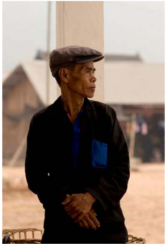
Tribal man and woman near Ou Tai

We went out for dinner and a few beers with our guide after the trek in Phongsaly. He got me to try a fertilized duck egg. It was really young so it didn't really look like a baby duck. The white part tasted like a hard egg white and the liquid kind of like chicken broth. I've had one not really planning on having another.