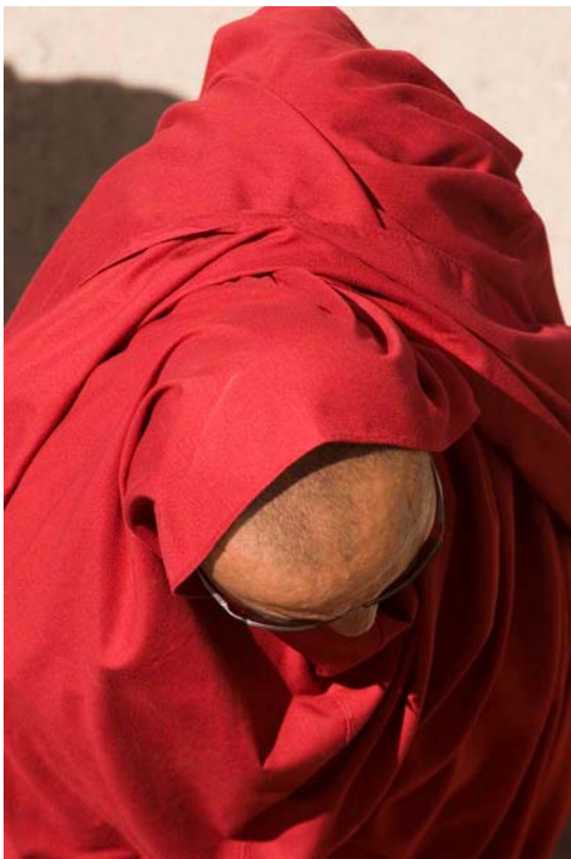
Monk from above, festival at Phyang Monastery.