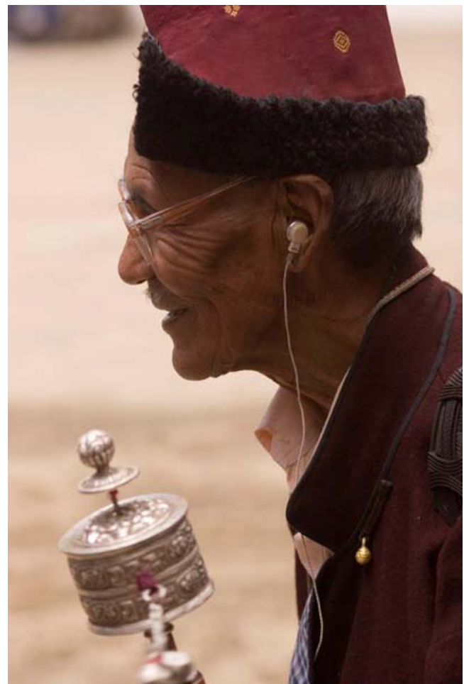
Traditionally dressed Ladakhi man with a prayer wheel, festival at Phyang Monastery.