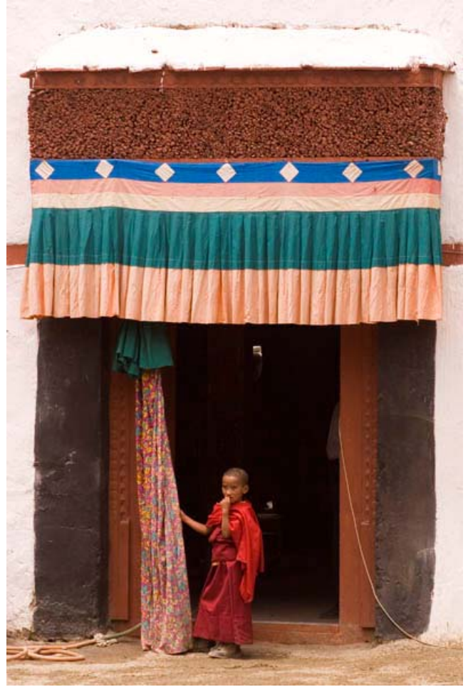
Young monk, festival at Phyang Monastery.