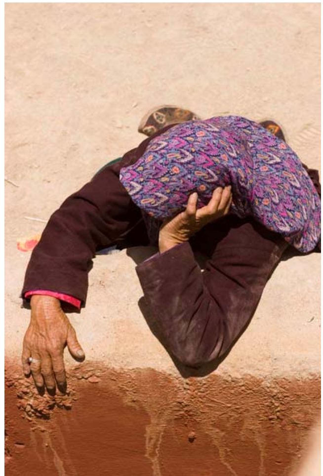
Ladakhi watching the festival from the roof, Phyang Monastery.