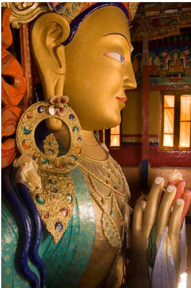
New large image of the future Buddha, Tikse Monastery.