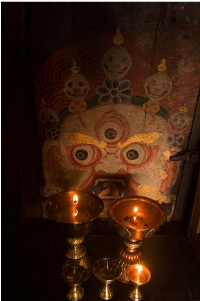
Guardian figure with butter lamps, Tikse Monastery.