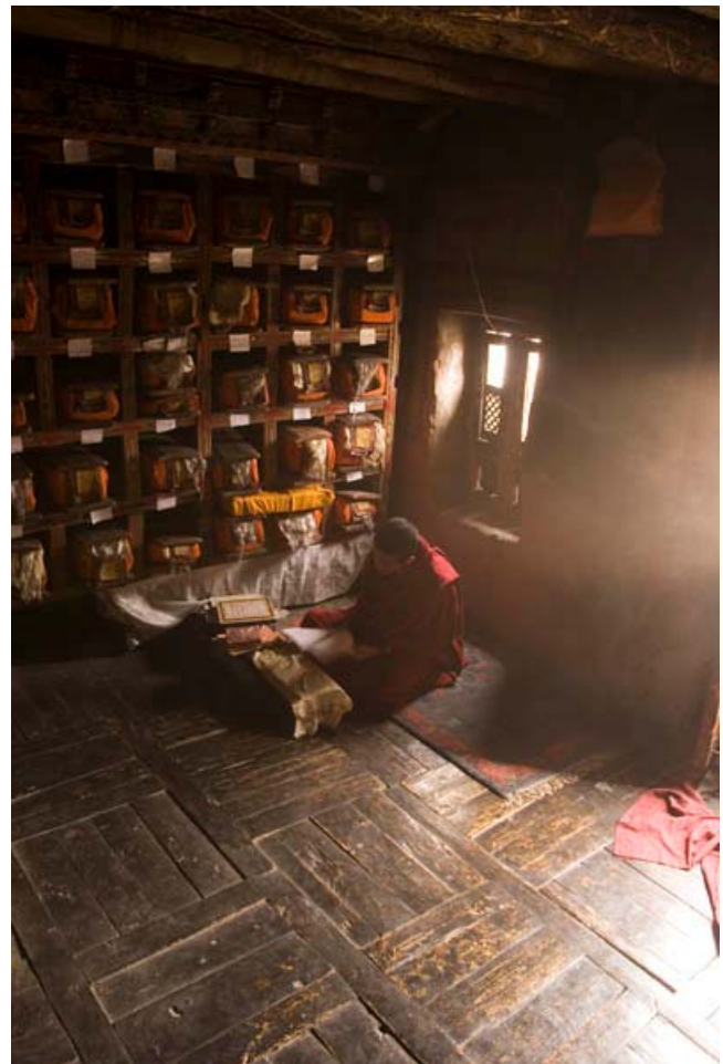
Monk reading in old library, Tikse Monastery.