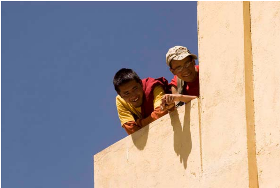
Watching the Cham dance from above, festival at Phyang Monastery.