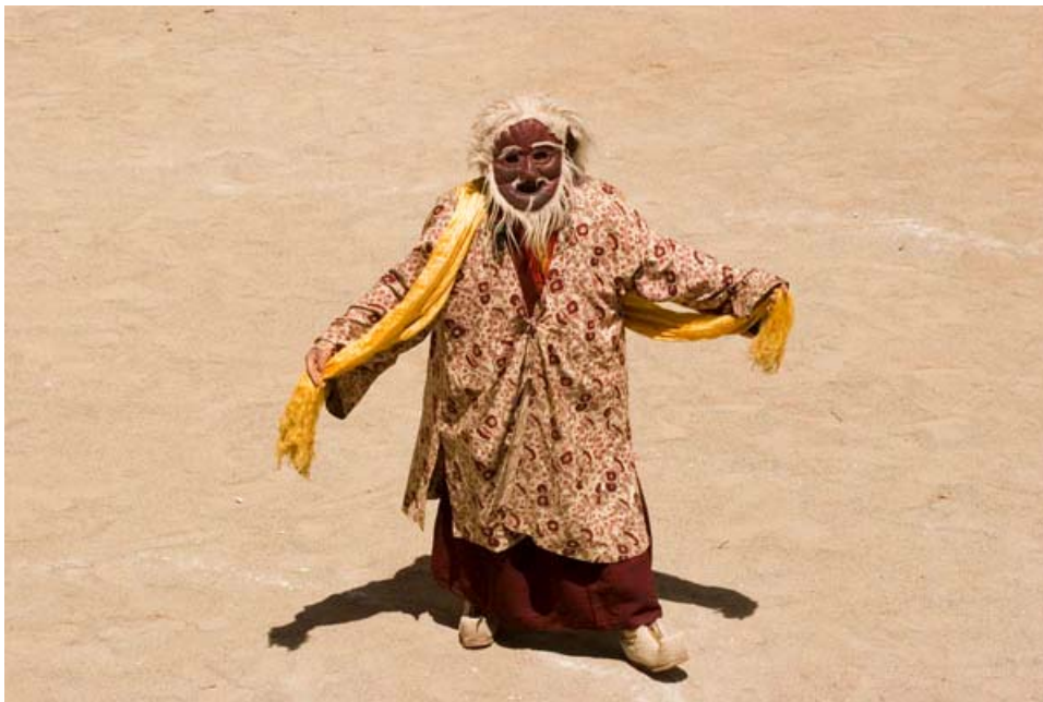
Cham dance during a festival at Phyang Monastery.