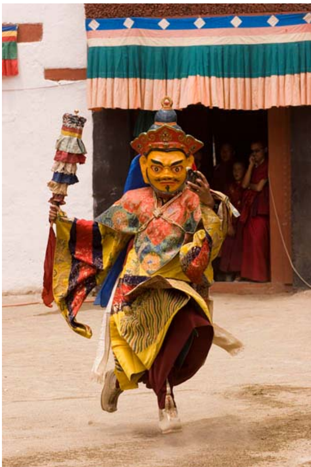
Cham dance during a festival at Phyang Monastery.