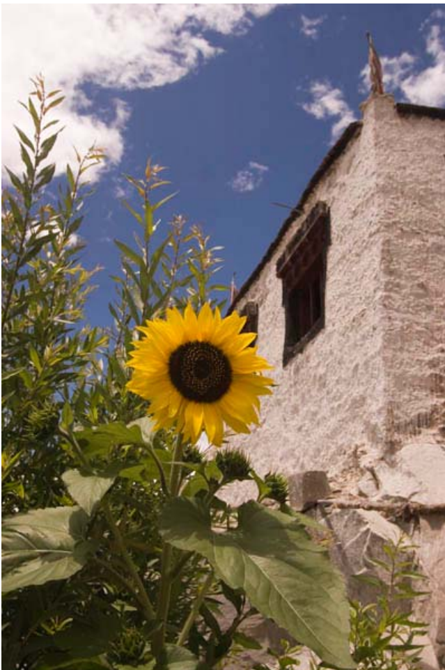
Sunflower, Tikse Monastery.