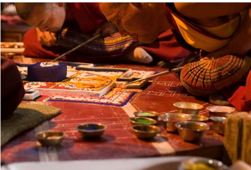
Monks creating sand mandala, Spituk Monastery.