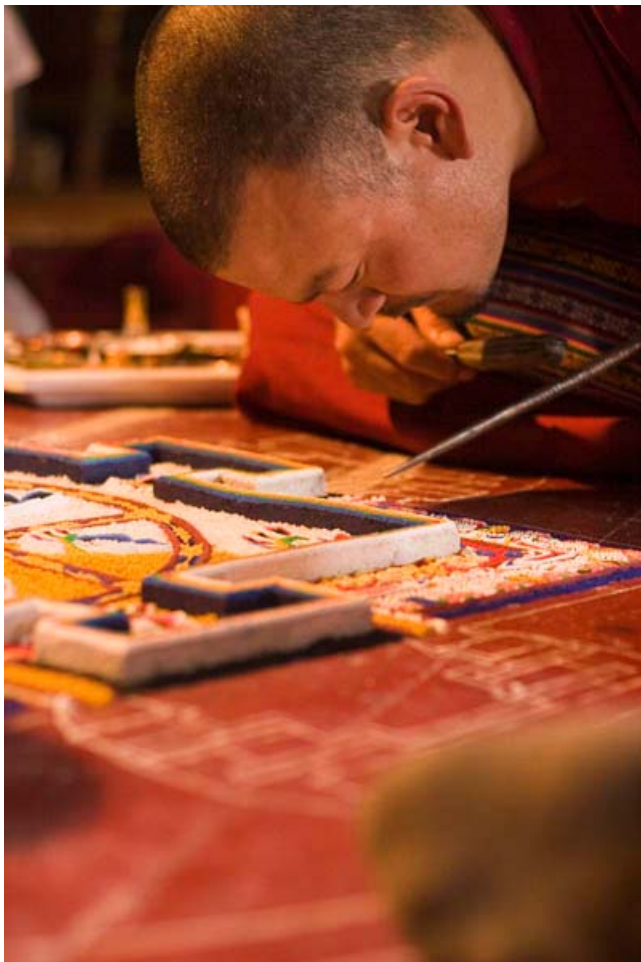
Monk creating sand mandala, Spituk Monastery.