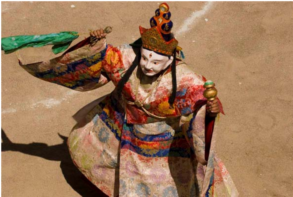
Cham dance during a festival at Phyang Monastery.