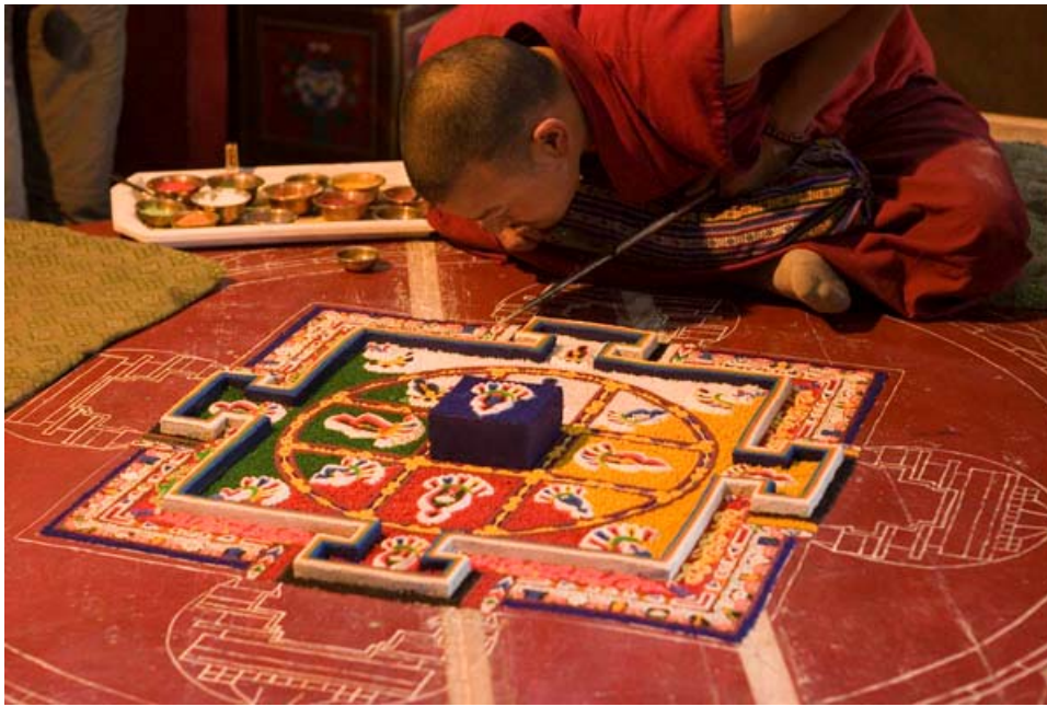
Monk creating sand mandala, Spituk Monastery.