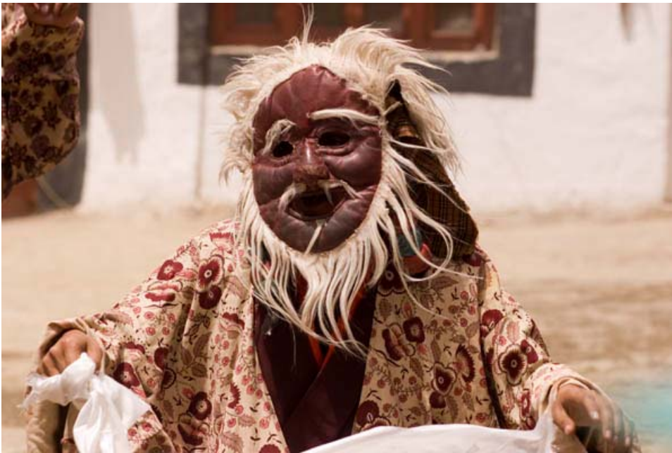
Cham dance during a festival at Phyang Monastery.