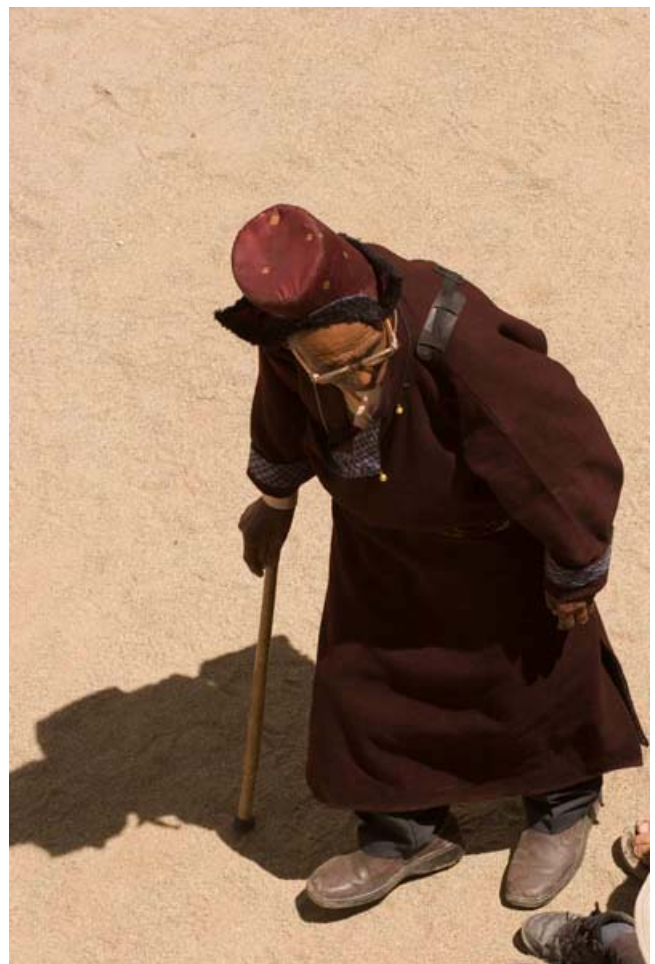
Traditionally dressed Ladakhi man, festival at Phyang Monastery.