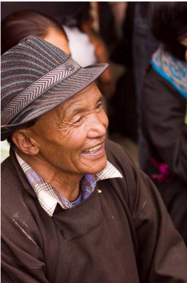
Ladakhi man, festival at Phyang Monastery.