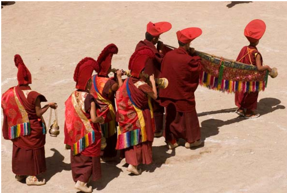
Monk procession during a festival at Phyang Monastery.