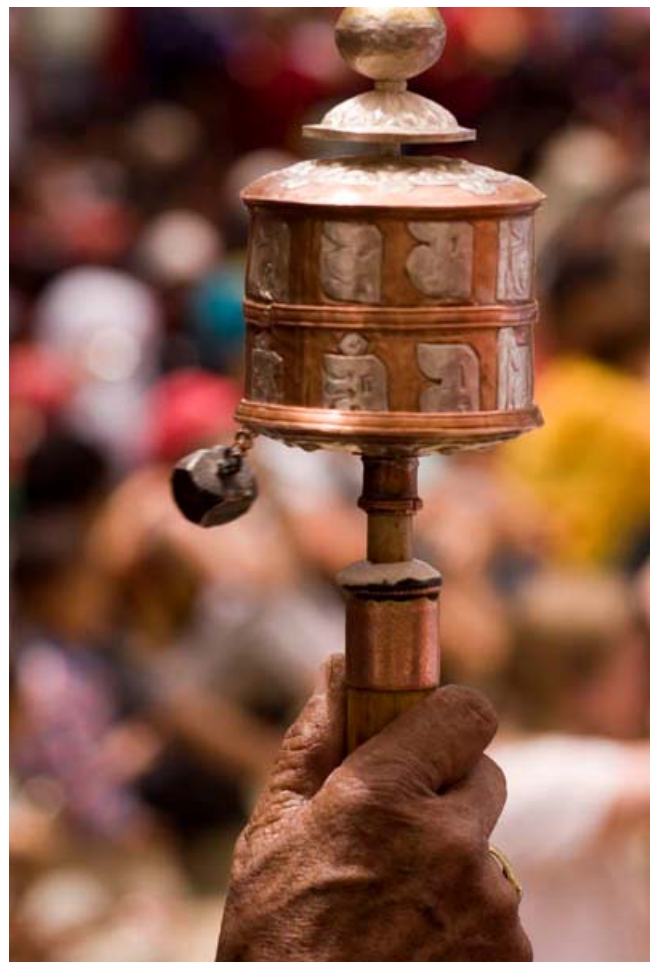
Man holds a prayer wheel, festival at Phyang Monastery.