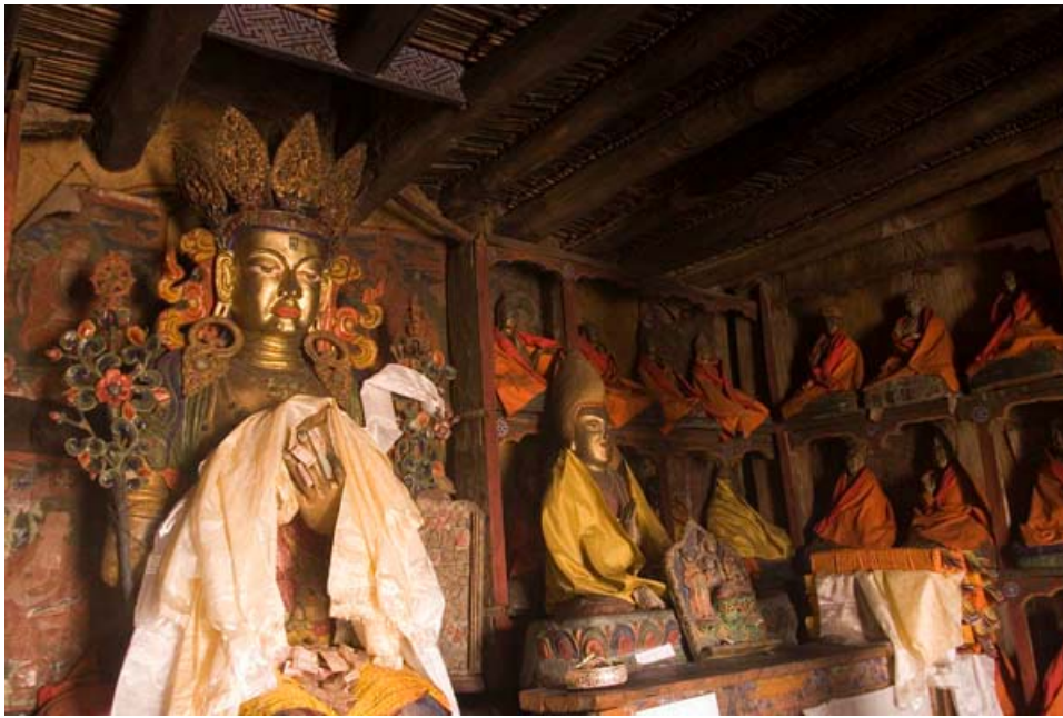
Image of the future Buddha in the old library, Tikse Monastery.