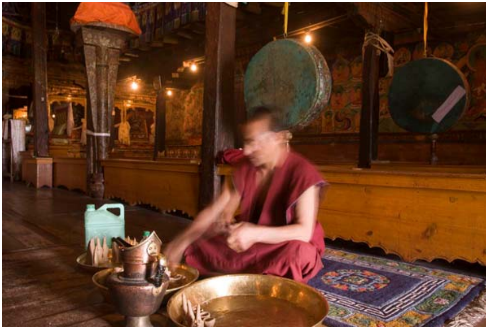
Monk creating offering items, Tikse Monastery.