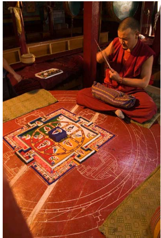
Monk creating sand mandala, Spituk Monastery.