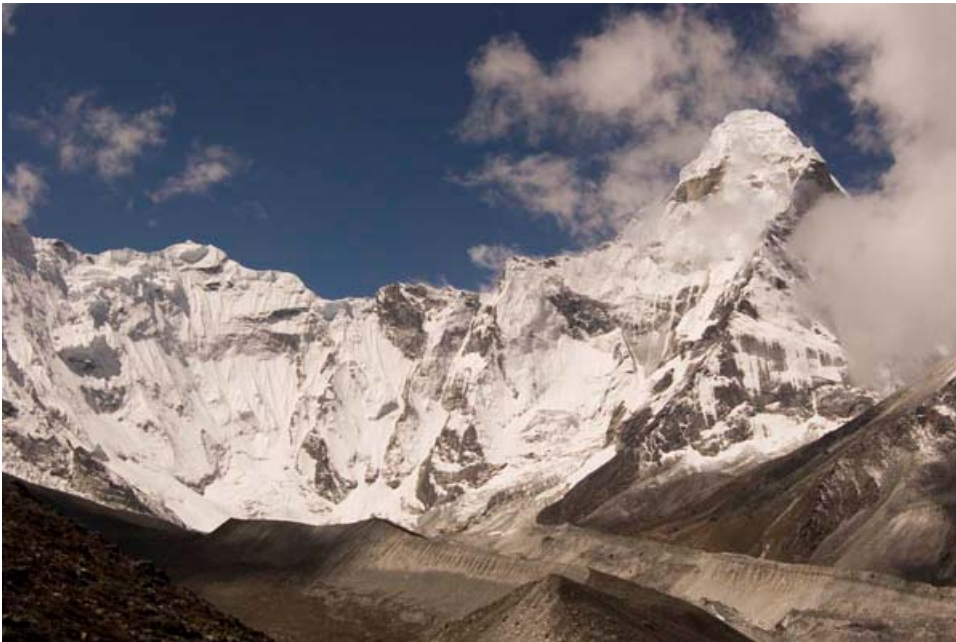
View of Ama Dablam from a hill south of Chukhung.