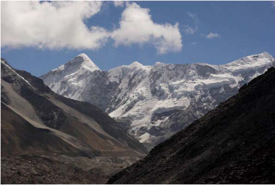
View from a hill south of Chukhung.