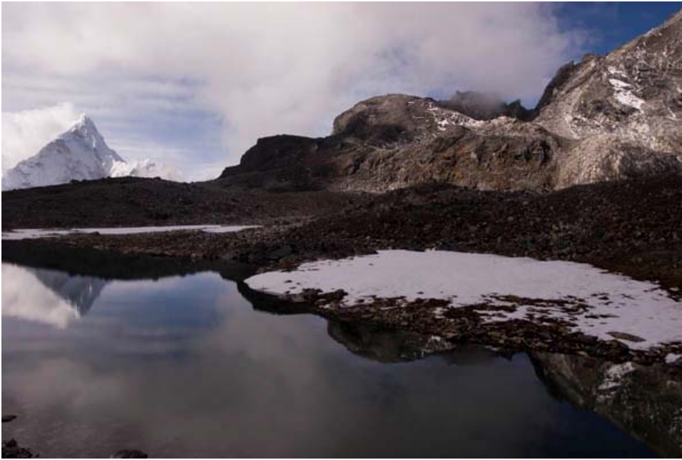
Ama Dablam reflected in a lake near the Kongma La.