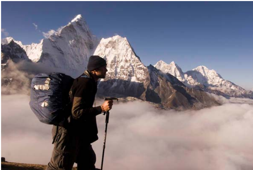
Self portrait, hiking on the trail to the Kongma La, with Ama Dablam in the background.