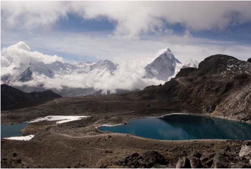
View from near the top of the Kongma La (5535m/ 18,159 ft).