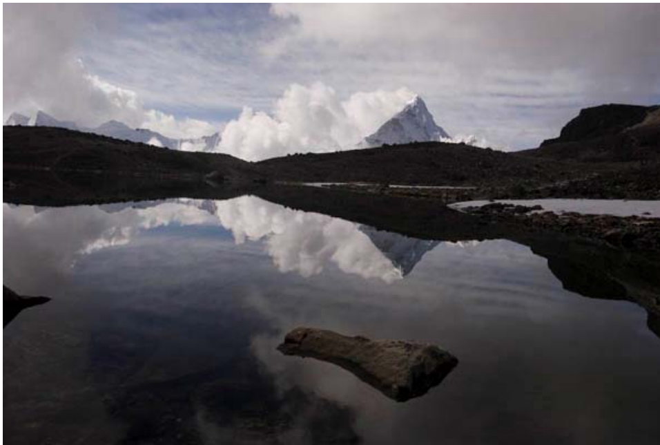
Ama Dablam reflected in a lake near the Kongma La.