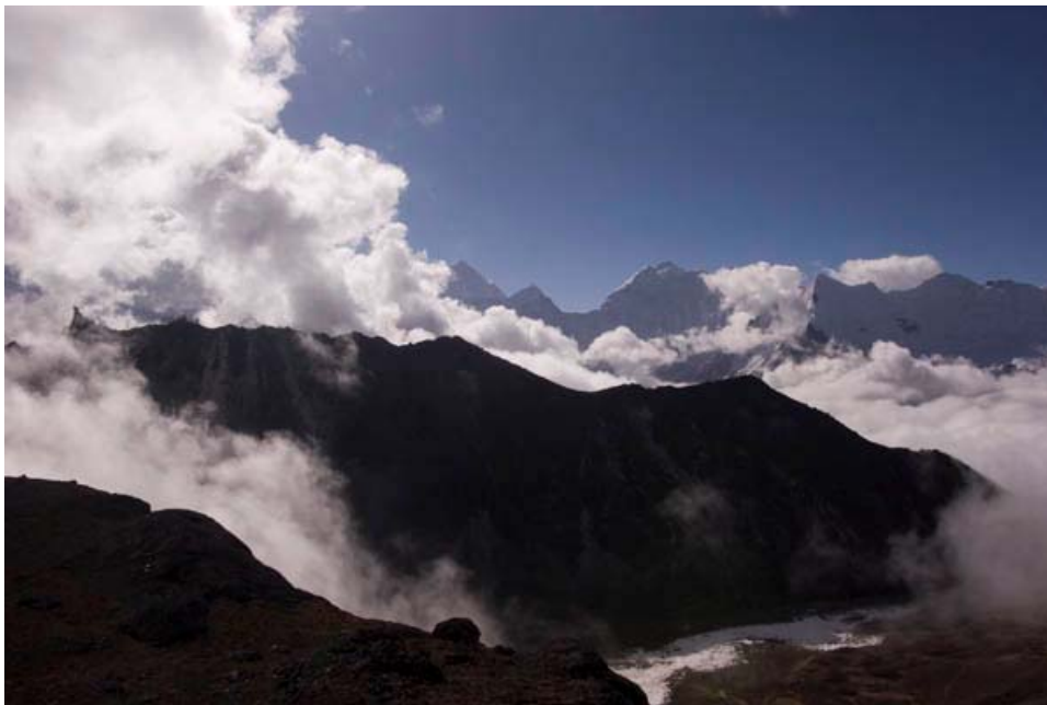
View along the trail to the Kongma La.