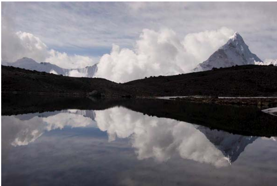
Ama Dablam reflected in a lake near the Kongma La.