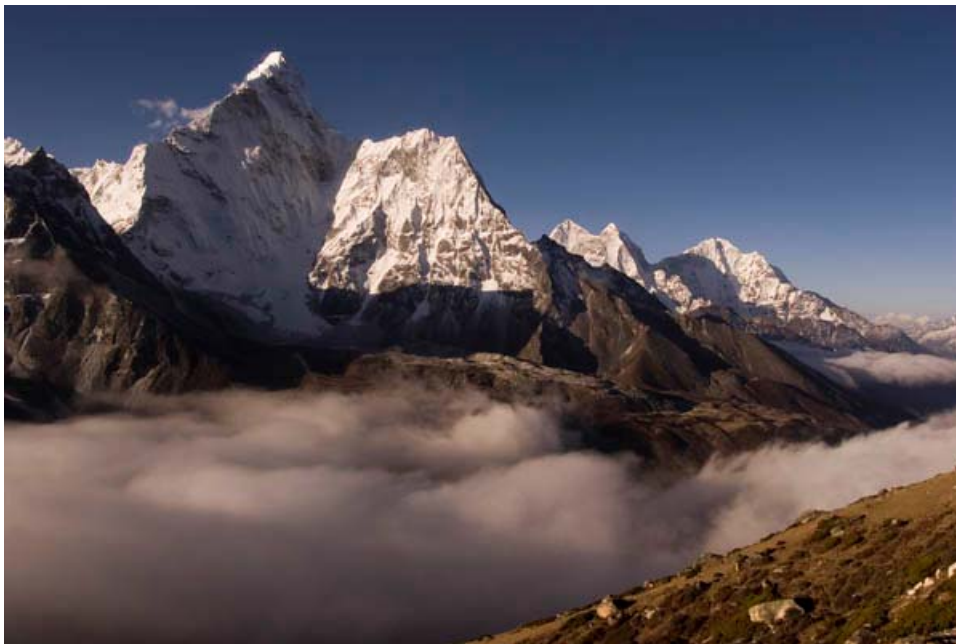
Ama Dablam from the trail to the Kongma La.