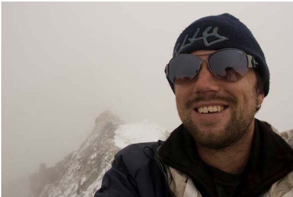
Me at the cloud shrouded summit of Chukhung Tse (5857m/19,216 ft). The highest point I've ever climbed to, and my first time over 19,000 ft not involving an airplane.