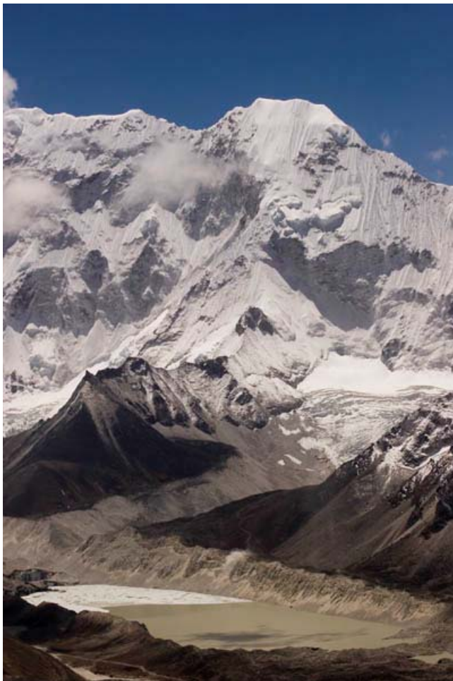
View of Imja Lake from Chukhung Ri, above Chukhung.