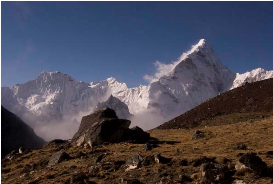
Ama Dablam from the trail to the Kongma La.