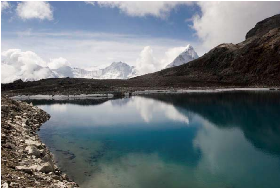
View from the highest lake near the top of the Kongma La.