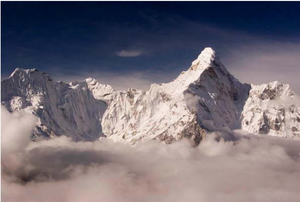
Ama Dablam from Chukhung Ri, above Chukhung.