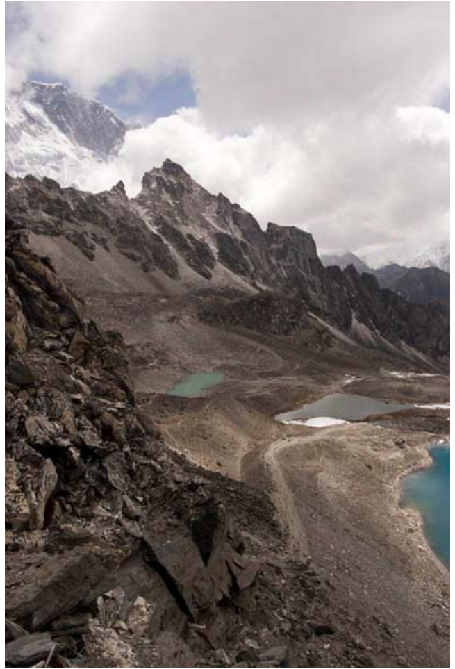
View from the top of the Kongma La (5535m/ 18,159 ft).