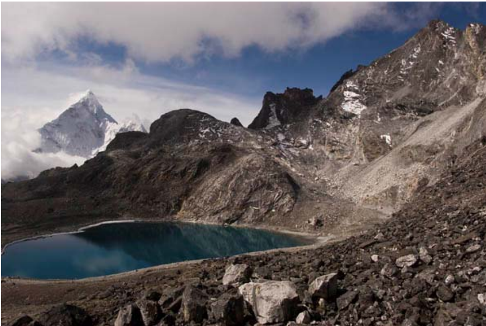
View from near the top of the Kongma La (5535m/ 18,159 ft).