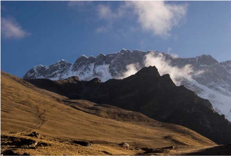
View of the Nuptse-Lhotse wall while climbing Chukhung Ri, above Chukhung.

forget how remote a place this really is. However, hiking up to the Kongma La in complete silence which was only occasionally broken by the low thunder of a distant avalanche, I was acutely aware of the remoteness of this region. The isolation in the midst of such incredible surroundings was awe inspiring. The weather stayed clear well into midmorning and as I passed the series of crystal clear lakes leading up to the pass, the white towering pyramid of Ama Dablam was reflected beautifully in there still waters. I reached the settlement of Loboche around 11:30 in the morning a little over 6 hours after I had left Chuckhung. I had intended to stay in Loboche but since it was still early I decided have lunch and continue hiking on to Gorak Shep, a fortuitous decision that would lead to one of the best and most unique experiences of my trek.