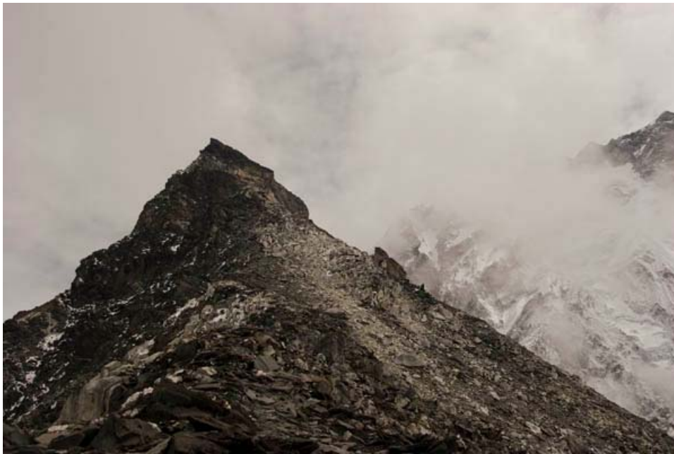
Looking towards the peak as the clouds close in around it, while climbing Chukhung Tse (5857m/19,216 ft). So close yet so far.