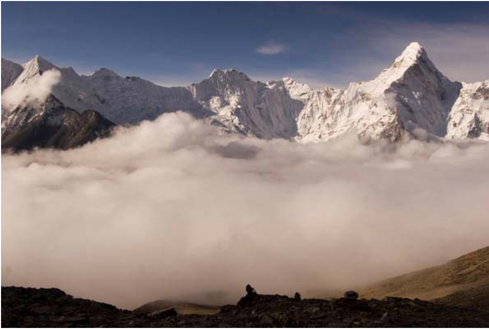
Ama Dablam from Chukhung Ri, above Chukhung.