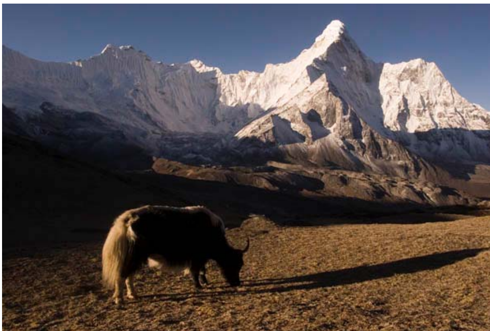
Yak grazing with a view of Ama Dablam while climbing Chukhung Ri, above Chukhung.