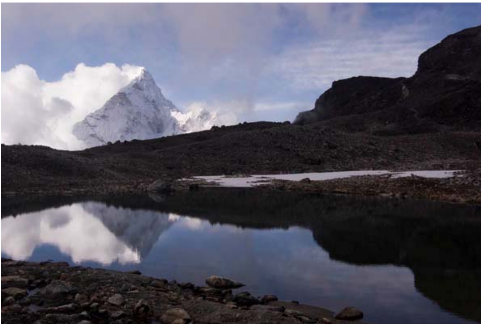
Ama Dablam reflected in a lake near the Kongma La.