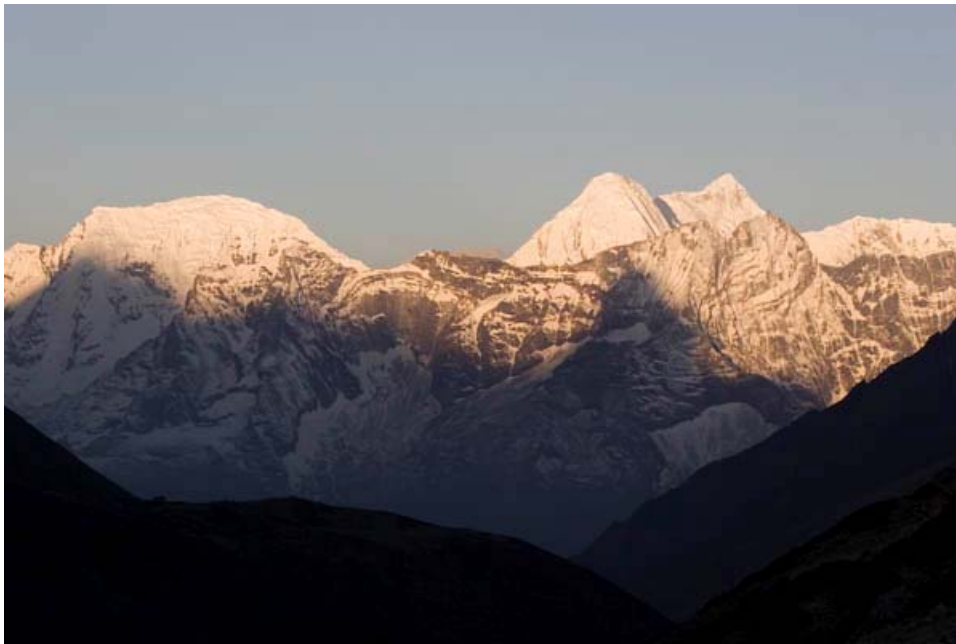
View down the valley from Chukhung.