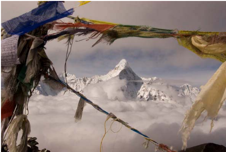
Ama Dablam through the prayer flags marking the top of Chukhung Ri (5559m/18,238 ft), above Chukhung.