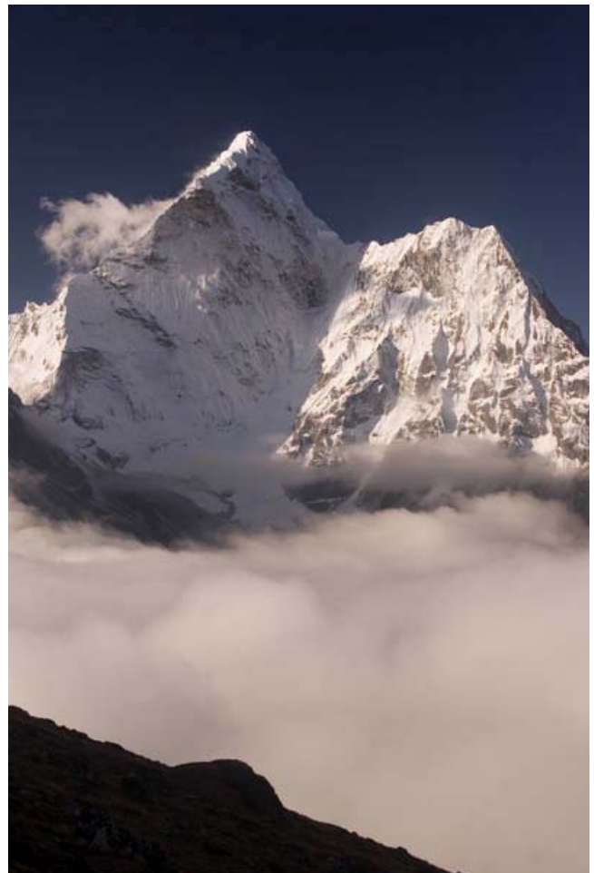
Ama Dablam from the trail to the Kongma La.