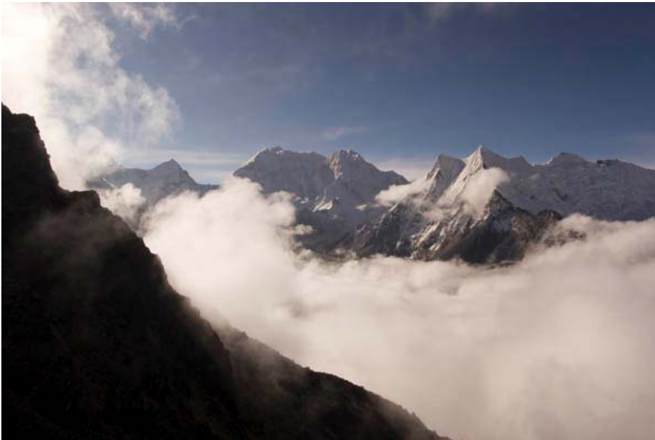
View while climbing Chukhung Ri, above Chukhung.