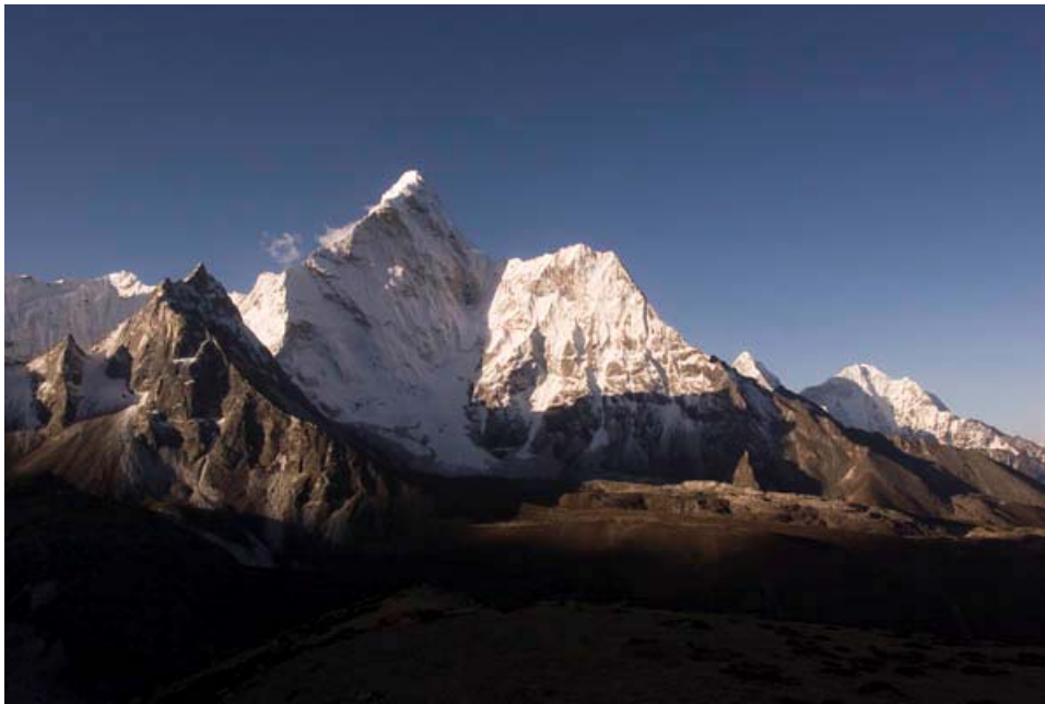
Ama Dablam from the trail to the Kongma La, near Chukhung.