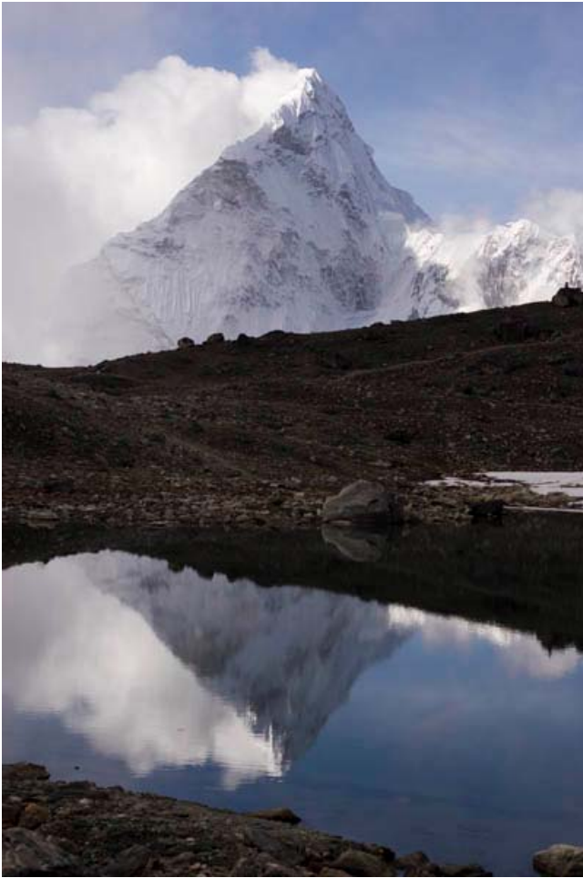
Ama Dablam reflected in a lake near the Kongma La.