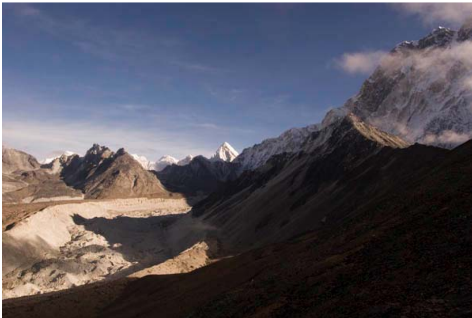
View while climbing Chukhung Ri en route to Chukhung Tse, above Chukhung. Chukhung Tse (5857m/19,216 ft) is the peak at the end of the ridge from the right of the picture below the snow covered Nuptse-Lhotse wall.