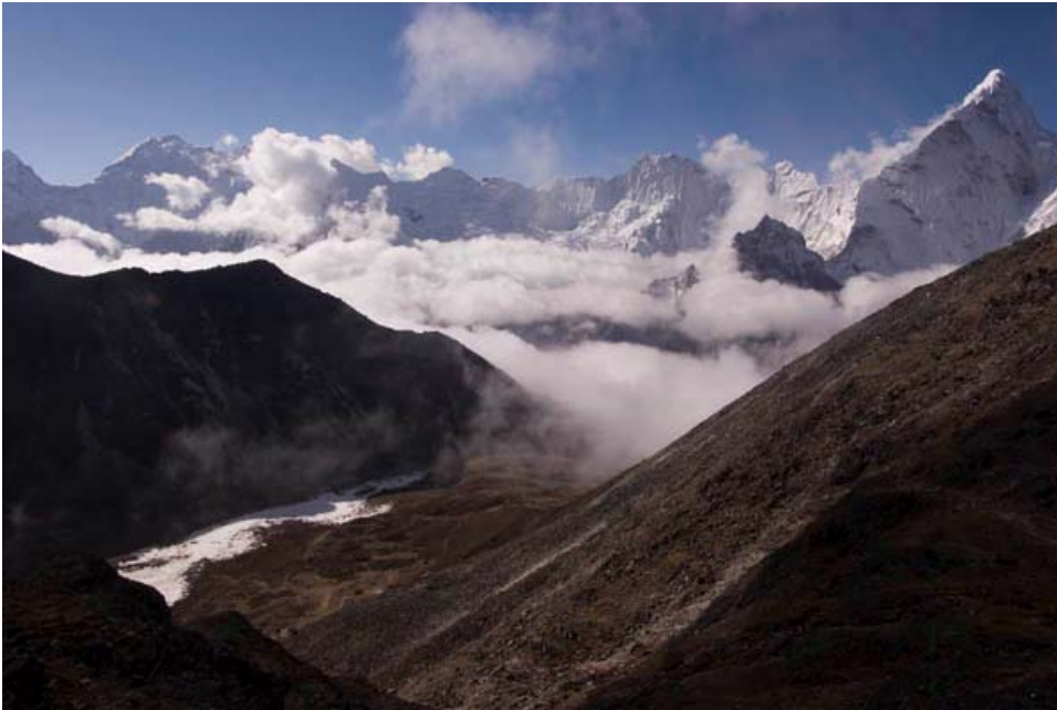
View along the trail to the Kongma La.