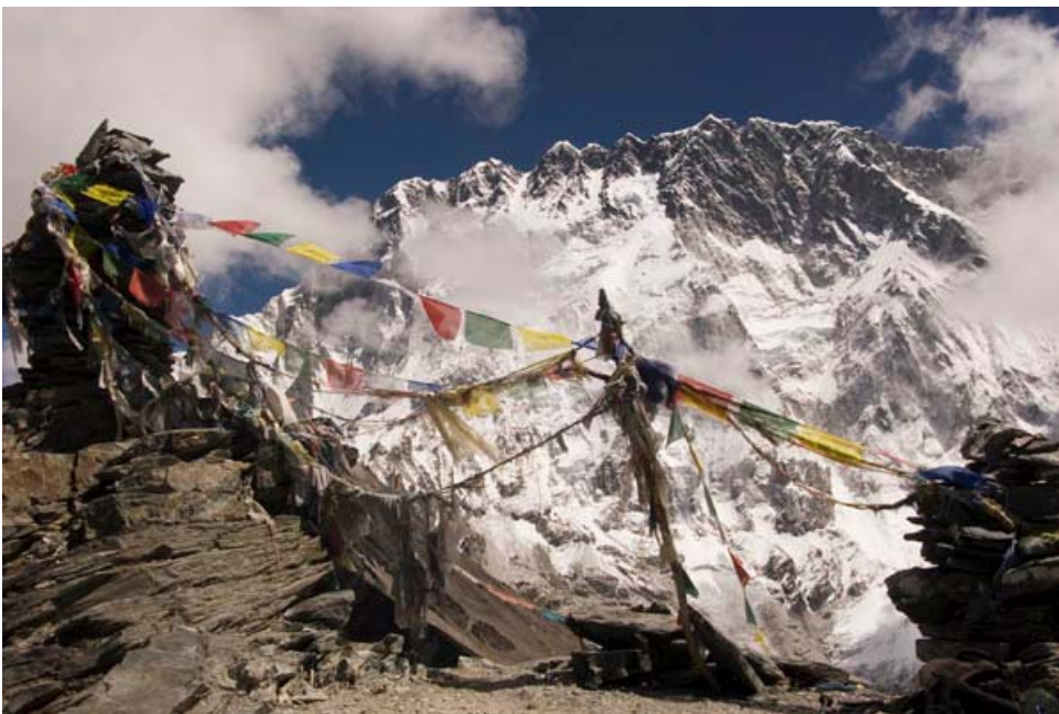
Prayer flags marking the top of Chukhung Ri (5559m/18,238 ft) with the Nuptse-Lhotse wall behind, above Chukhung.