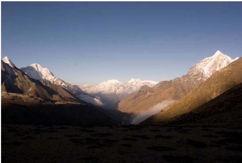
View down the valley from the trail to the Kongma La, near Chukhung.