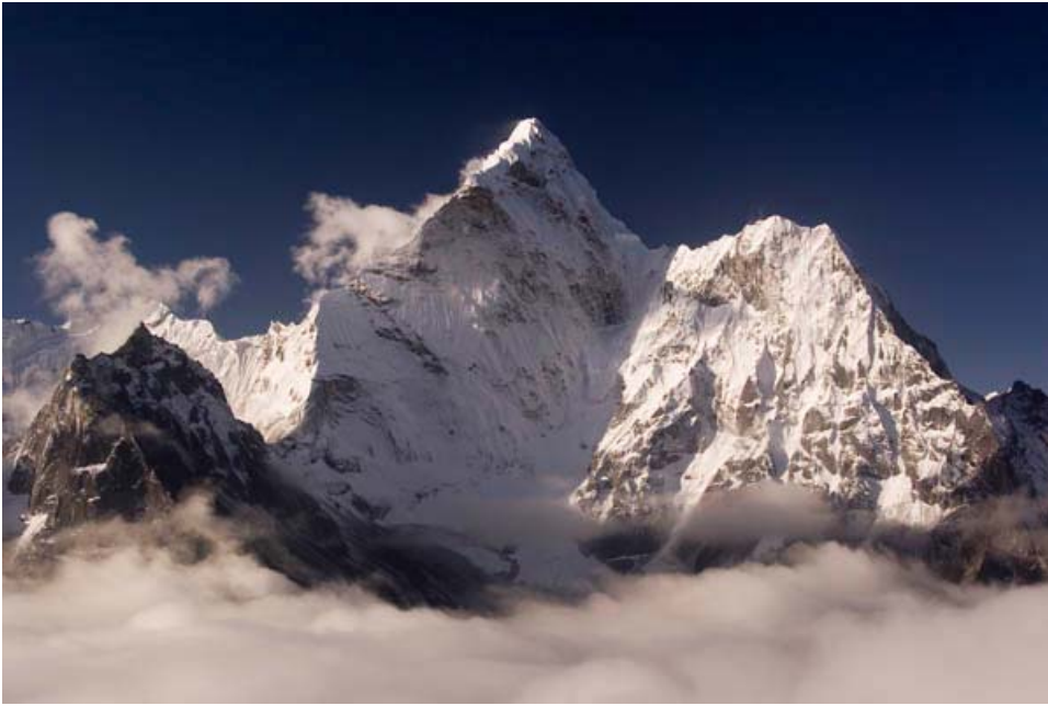
Ama Dablam from the trail to the Kongma La.