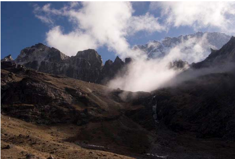
View along the trail to the Kongma La.