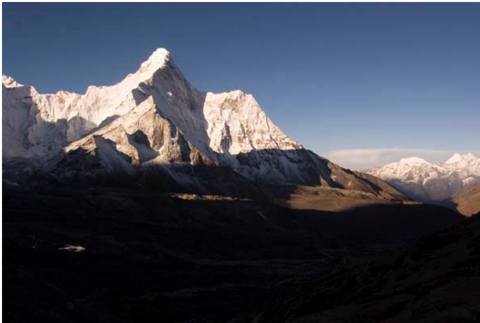
View of Ama Dablam while climbing Chukhung Ri, above Chukhung.