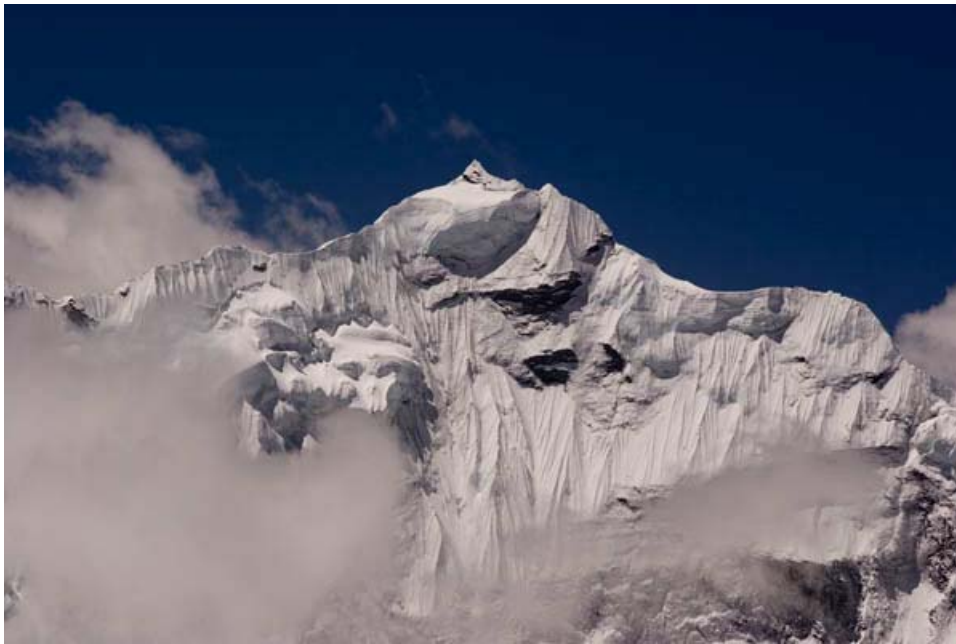
Snow capped peak from Chukhung Ri, above Chukhung.