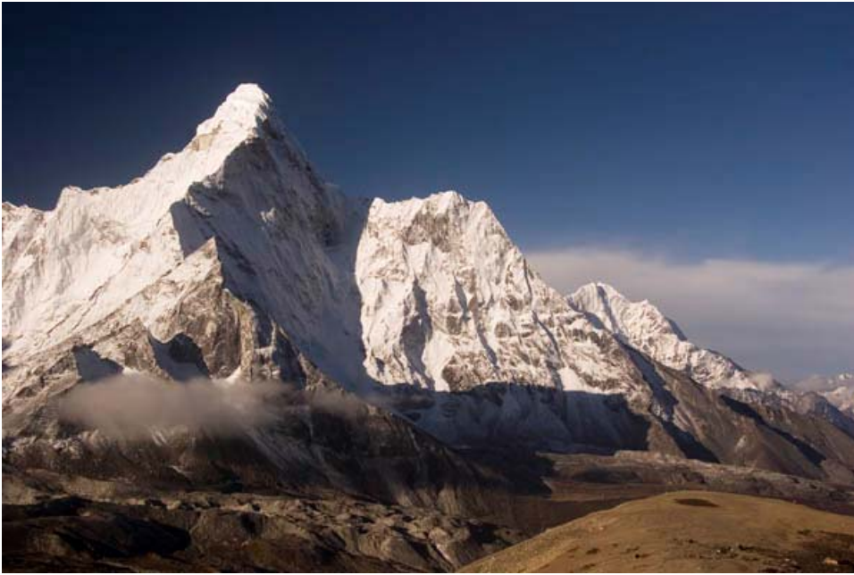
Ama Dablam from Chukhung Ri, above Chukhung.