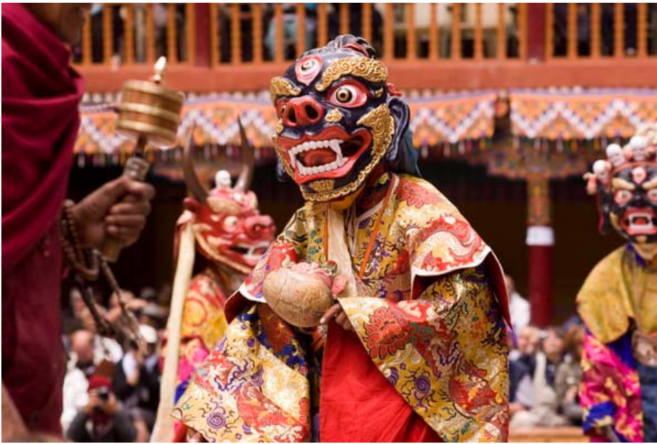
Cham dance, Hemis Festival.