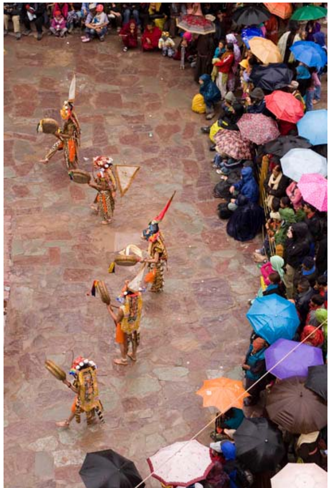
Cham dance, Hemis Festival.