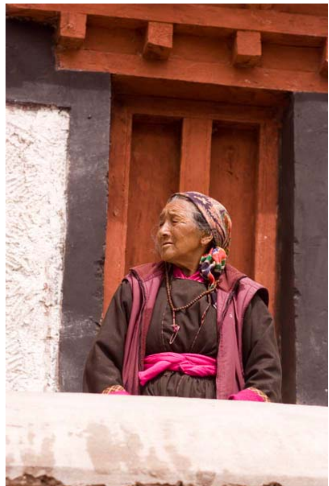
Ladakhi woman, Hemis Festival.