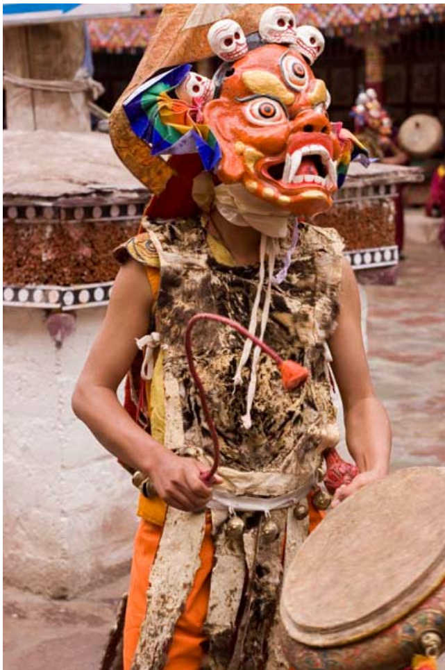
Cham dance, Hemis Festival.