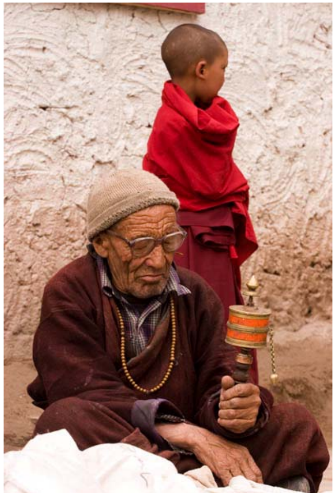
Ladakhi man with a prayer wheel, Hemis Festival.