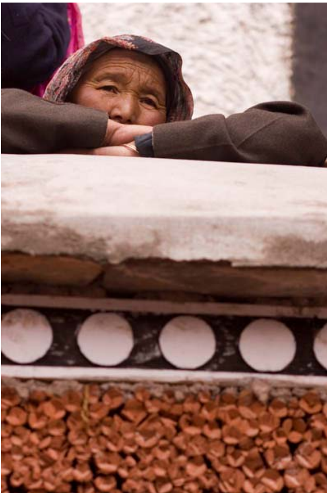
Ladakhi woman watching Cham dance, Hemis Festival.