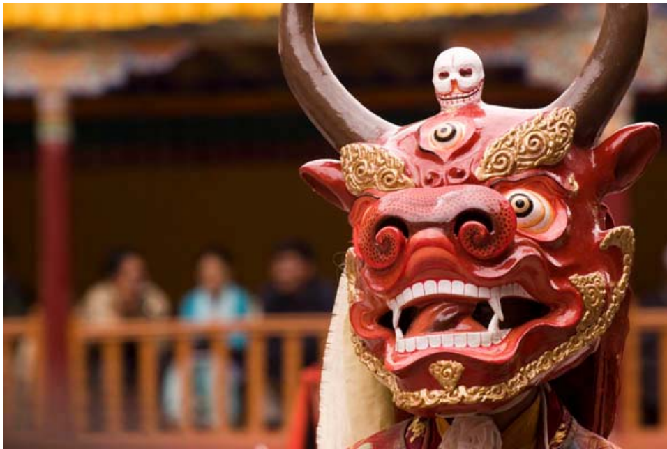
Cham dance, Hemis Festival.