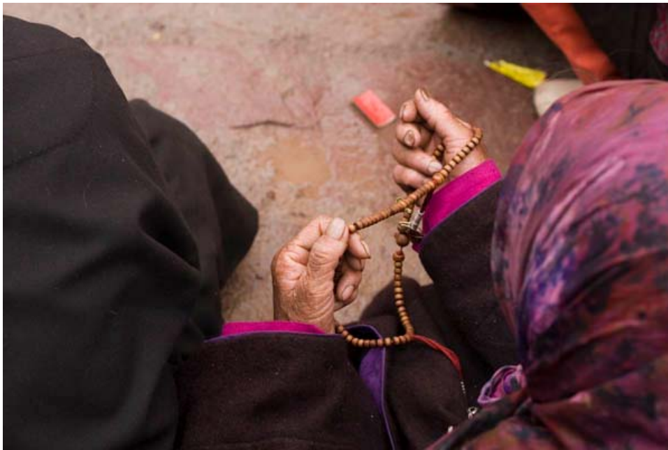
Ladakhi woman holding prayer beads, Hemis Festival.