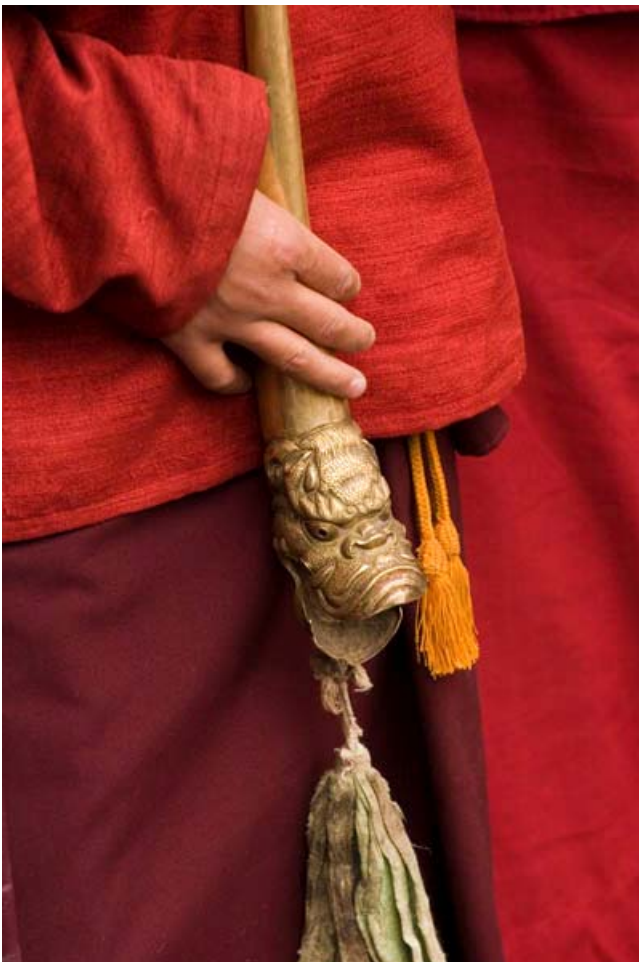
Monk holding ceremonial horn, Hemis Festival.