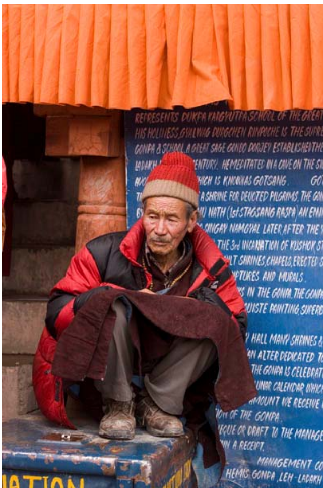
Ladakhi man, Hemis Festival.