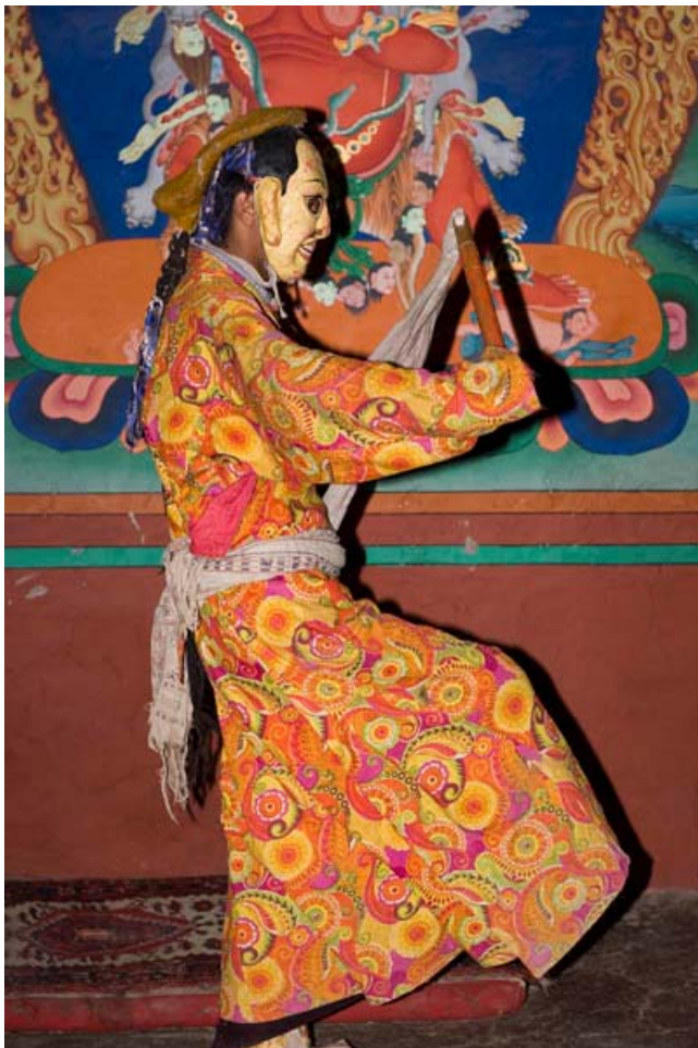
Monk rehearses for Cham dance, Hemis Festival.