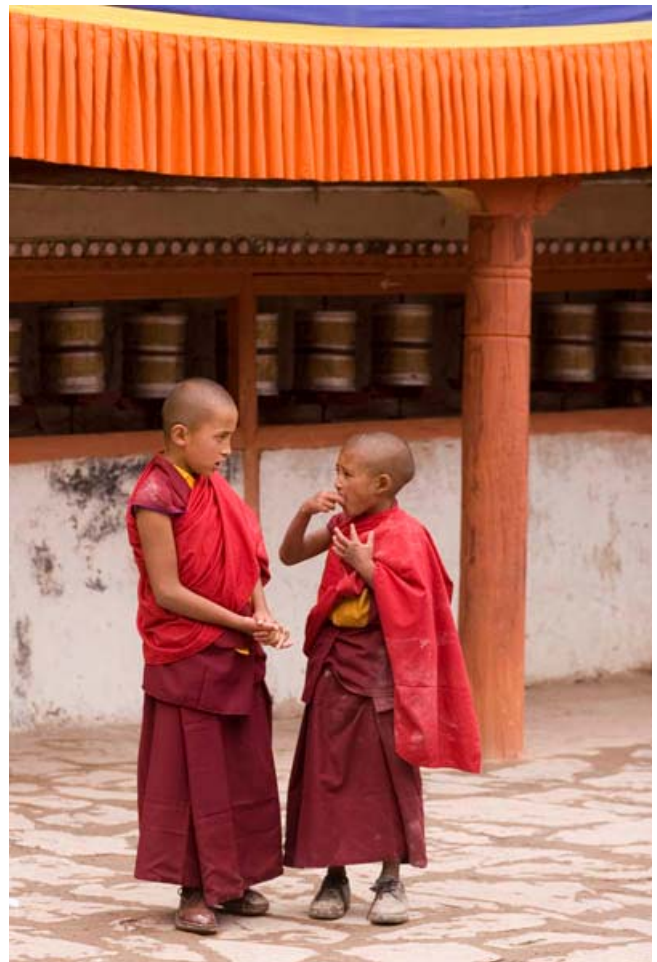
Young monks, Hemis Festival.