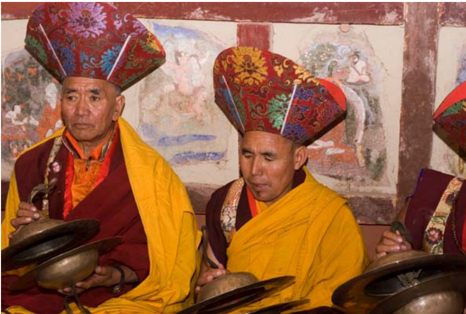
Monks playing cymbals, Hemis Festival.