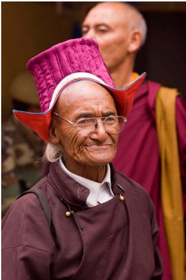
Traditionally dressed Ladakhi man, Hemis Festival.