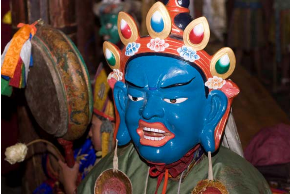
Monks preparing for Cham dance, Hemis Festival.