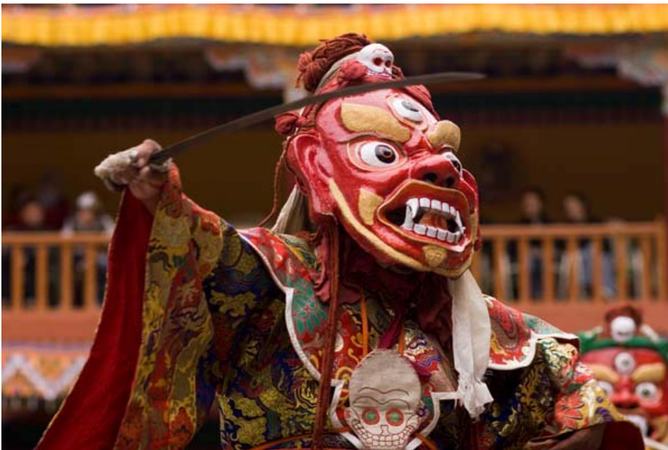
Cham dance, Hemis Festival.