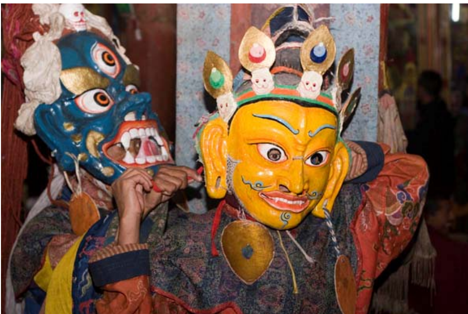
Monks preparing for Cham dance, Hemis Festival.