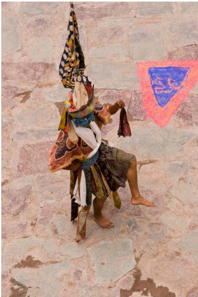
Cham dance, Hemis Festival.