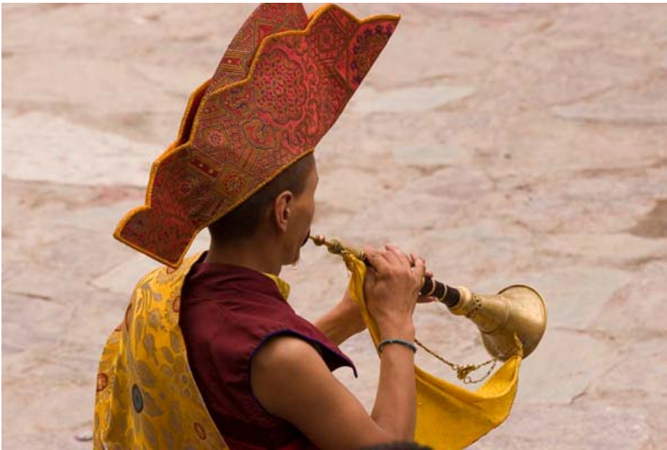
Monk playing horn, Hemis Festival.