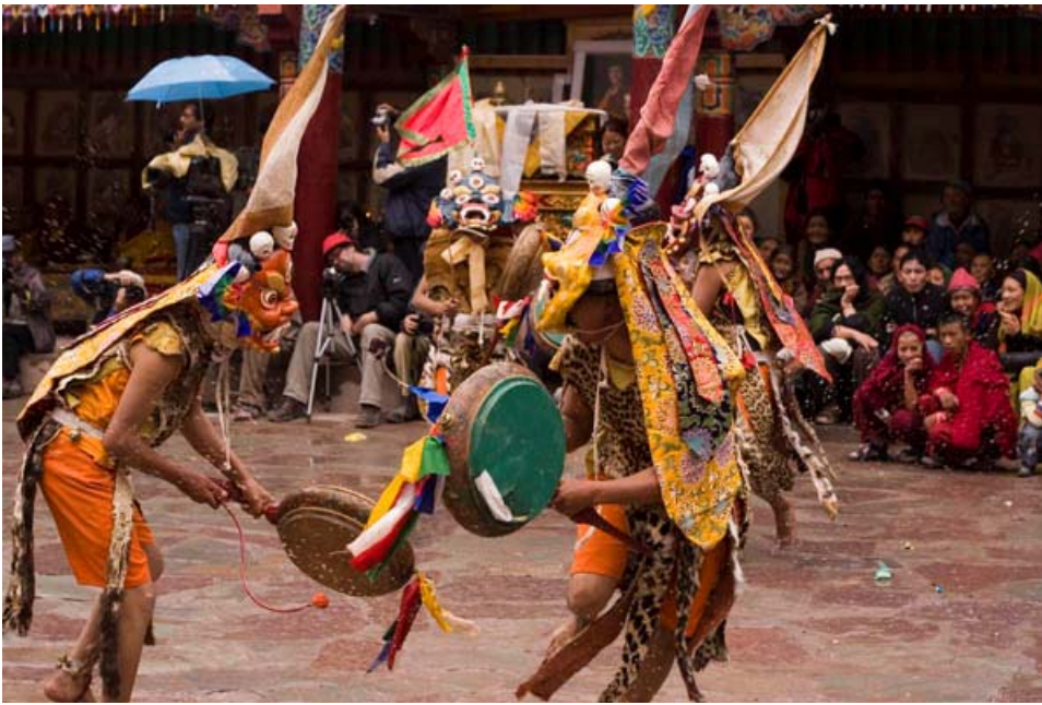
Cham dance, Hemis Festival.