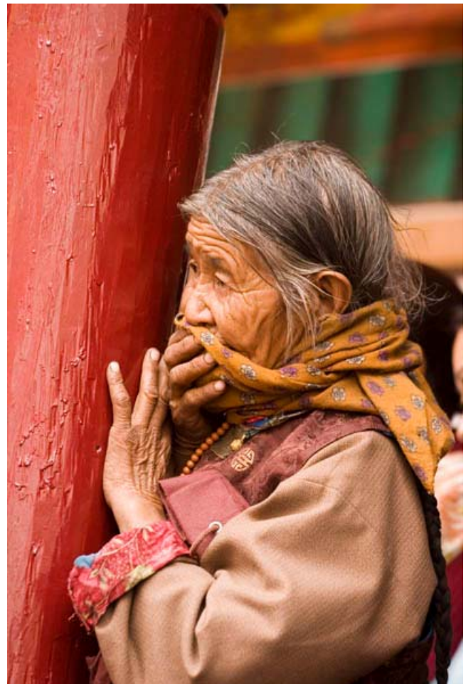
Ladakhi woman, Hemis Festival.