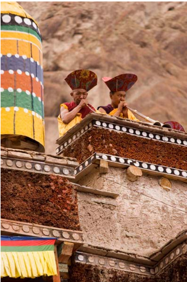
Monks blowing trumpets, Hemis Festival.