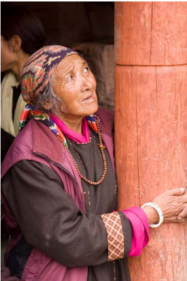
Ladakhi woman, Hemis Festival.