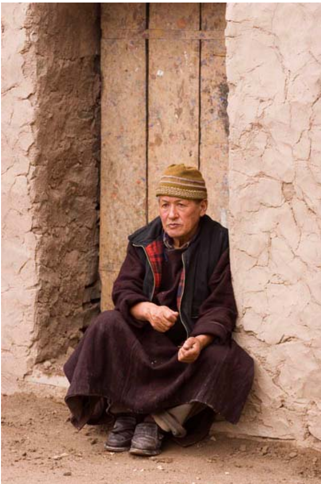
Local resting at the Hemis Festival.