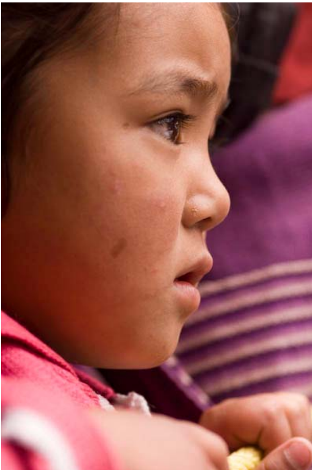
Ladakhi girl watching Cham dance, Hemis Festival.