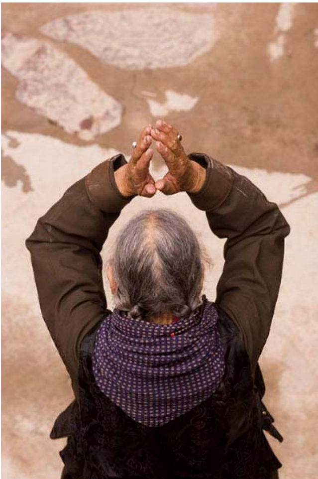
Ladakhi woman prostrating, Hemis Festival.