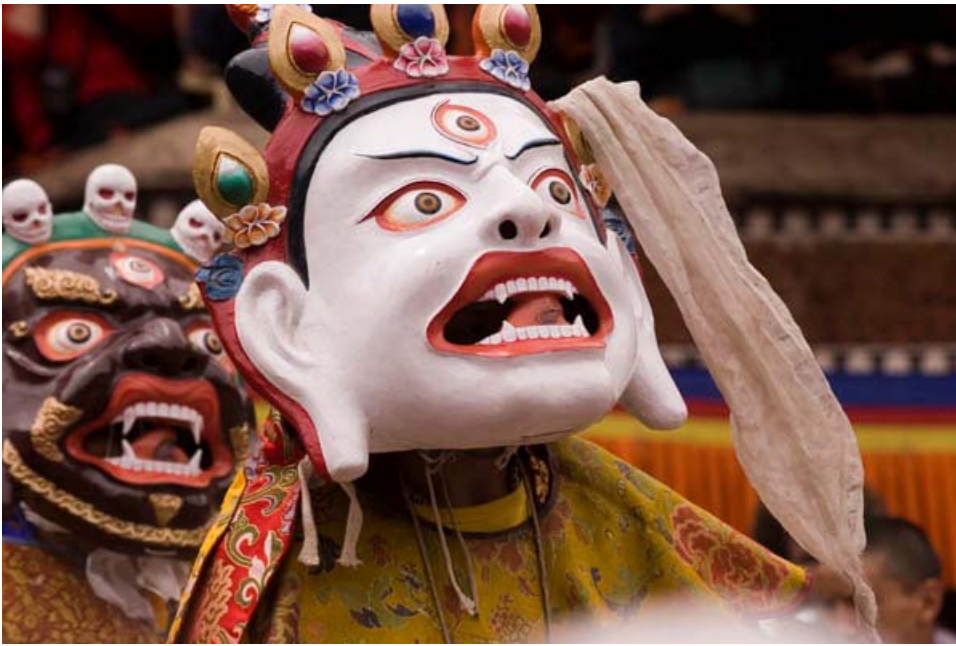
Cham dance, Hemis Festival.