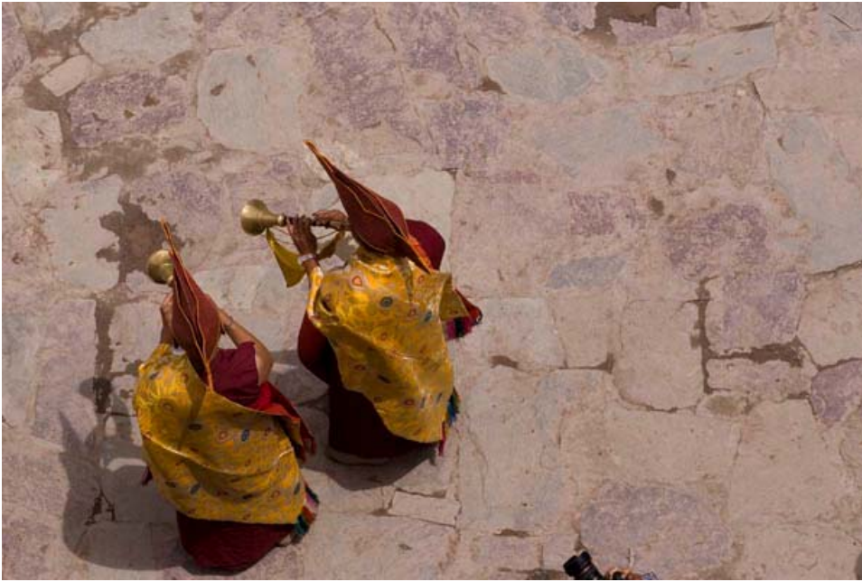
Monks blowing trumpets, Hemis Festival.