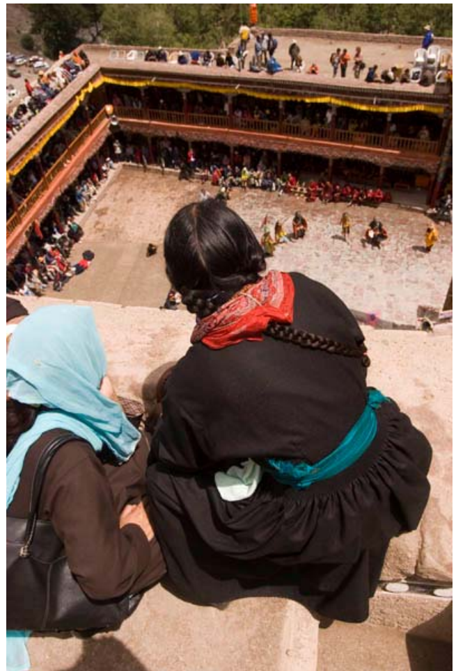
Ladakhi woman watching the Cham dance from the roof of the monastery, Hemis Festival.