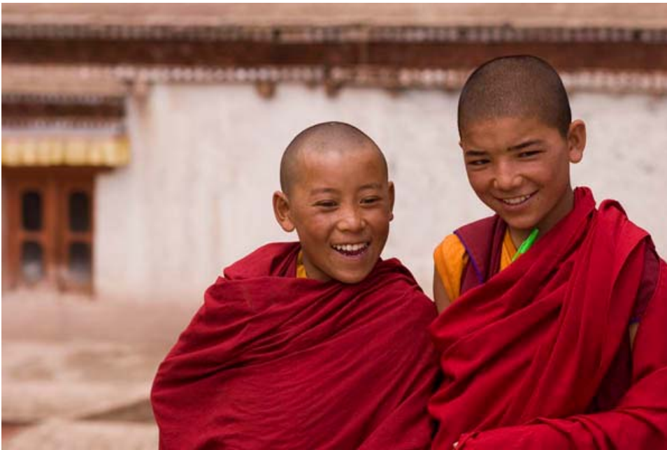
Young monks, Hemis Festival.