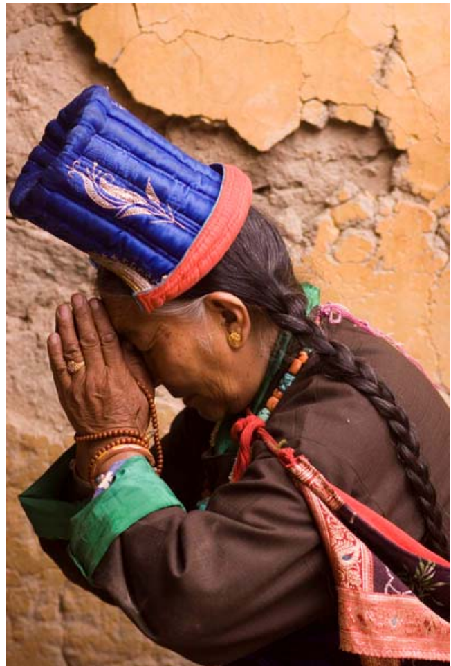
Traditionally dressed Ladakhi woman praying, Hemis Festival.