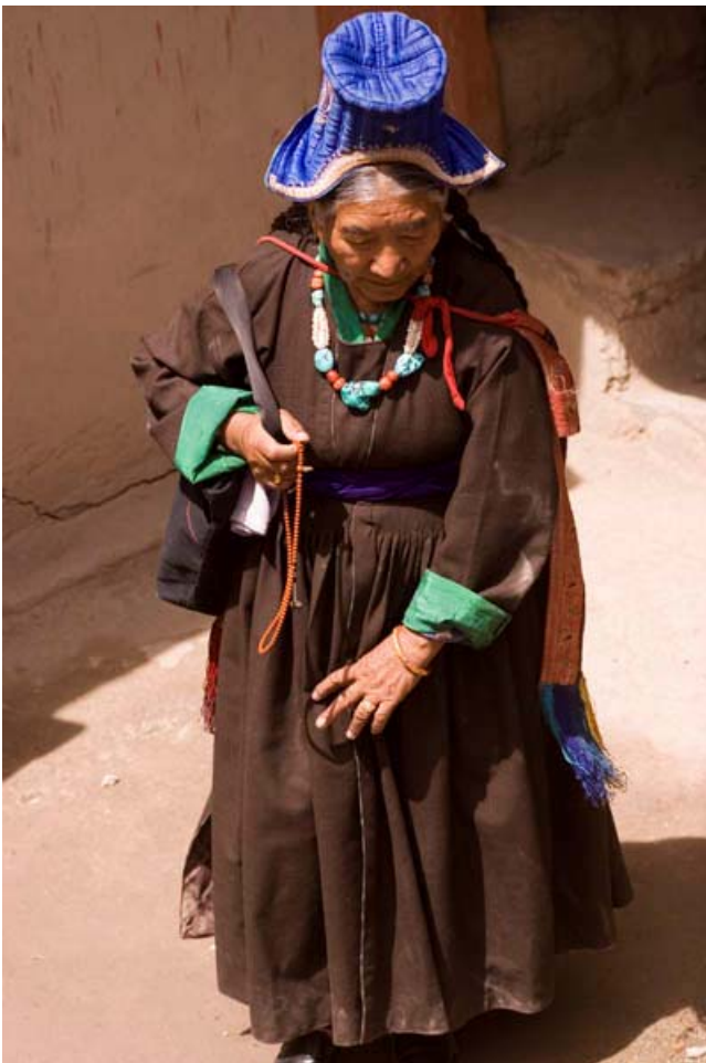
Traditionally dressed Ladakhi woman, Hemis Festival.