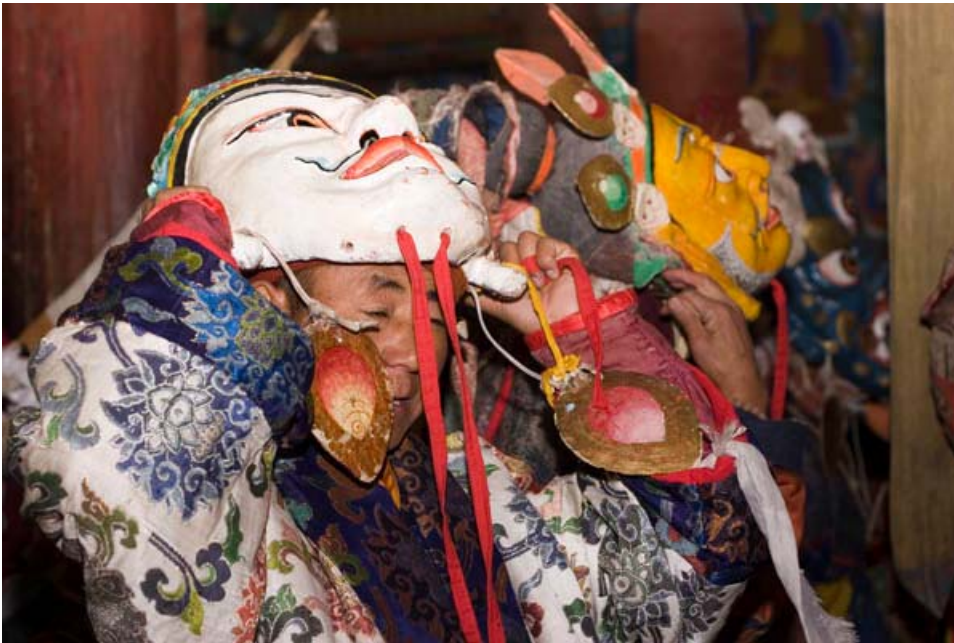
Monks preparing for Cham dance, Hemis Festival.

Shortly after I arrived in Ladakh, the festival at the Monastery of Hemis was scheduled to take place. Probably among the most touristy of the monastic Cham dance (traditional Tibetan masked dances) festivals in Ladakh, due to its proximity to Leh and the fact that it takes place in the summer during the height of the tourist season. Other monastic celebrations typically take place during the winter months when there are few tourists around braving the bitter Ladakhi winter. Nevertheless, the Hemis festival is a great opportunity for photography with locals dressed in their finest traditional garb as well as the spectacularly ornate masks of the Cham dancers as subjects. I enjoyed wondering through the crowds taking pictures even if I did feel a bit like a paparazzi amidst the crowd of camera-touting foreign tourists.