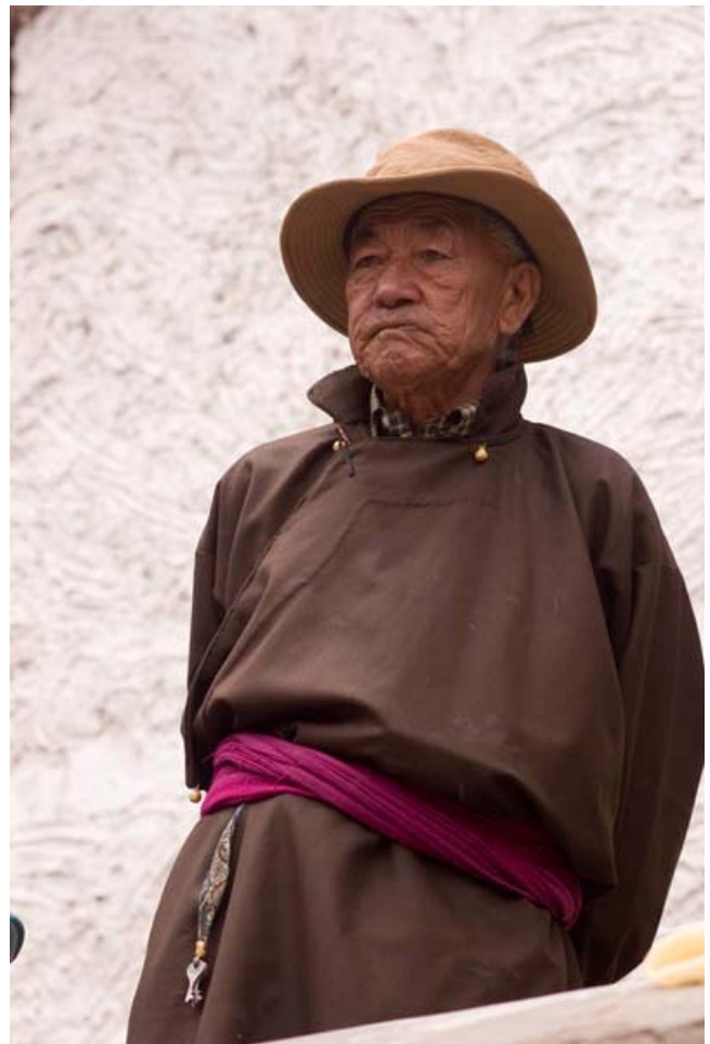
Ladakhi man watching Cham dance, Hemis Festival.