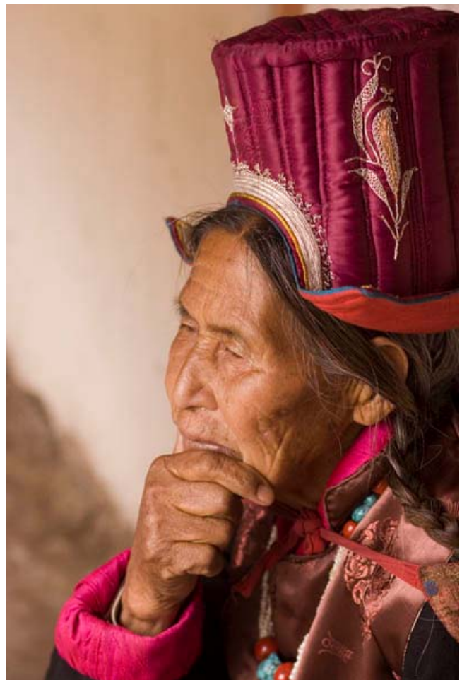
Traditionally dressed Ladakhi woman, Hemis Festival.