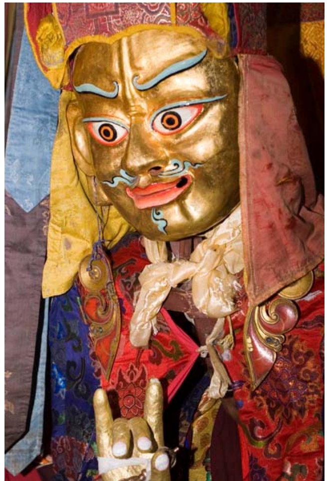
Padmasambhava depicted in Cham dance, Hemis Festival.