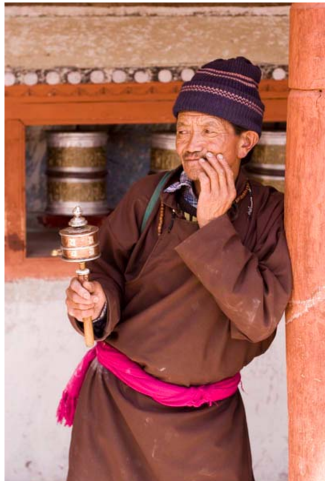
Ladakhi man with a prayer wheel, Hemis Festival.