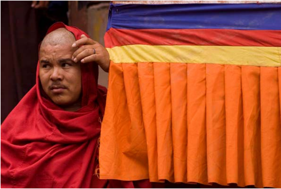
Monk watching Cham dance, Hemis Festival.