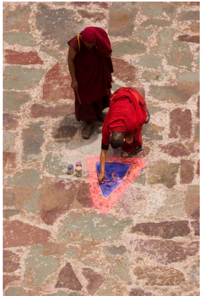
Monks preparing courtyard for Cham dance, Hemis Festival.