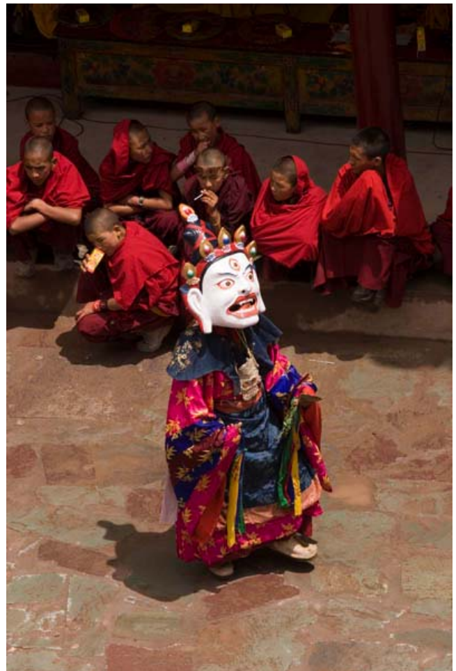
Cham dance, Hemis Festival.