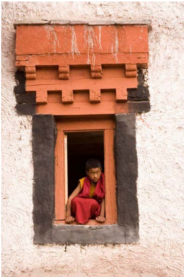
Monk watching Cham dance, Hemis Festival.