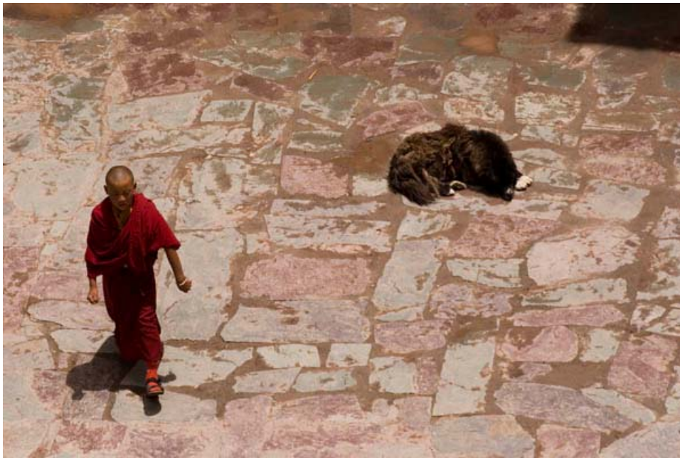
Monk and dog in the courtyard, Hemis Festival.