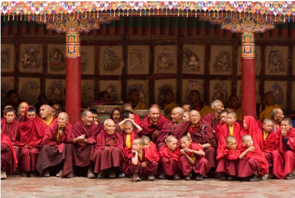
Monks watching Cham dance, Hemis Festival.