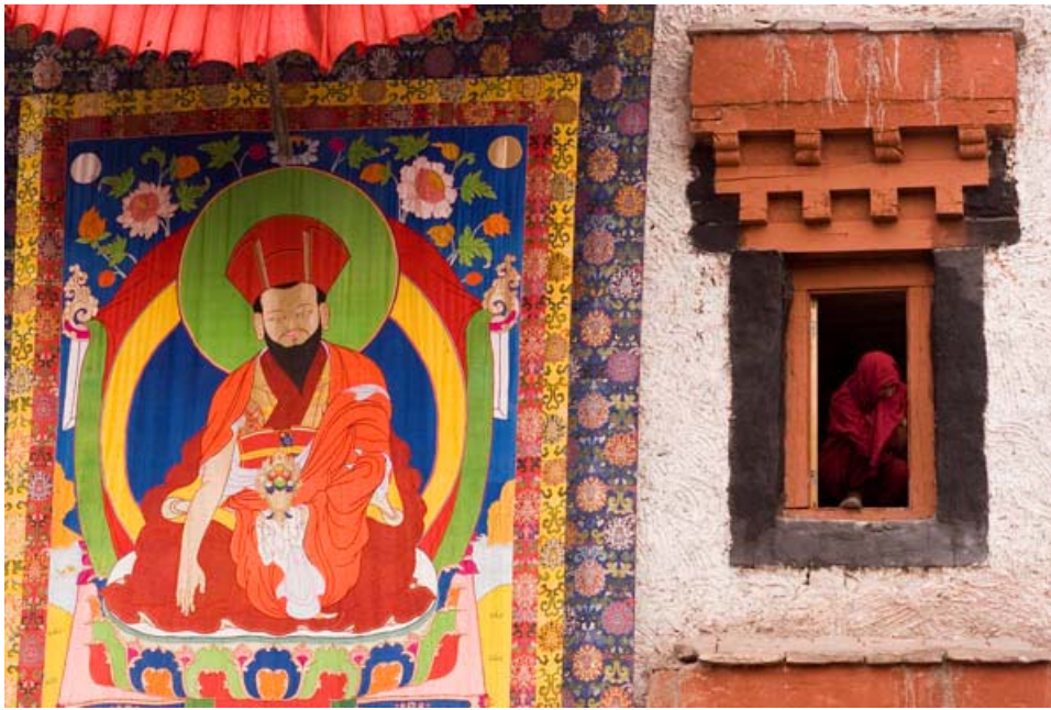
Monk watching Cham dance from a window next to a large thangka, Hemis Festival.