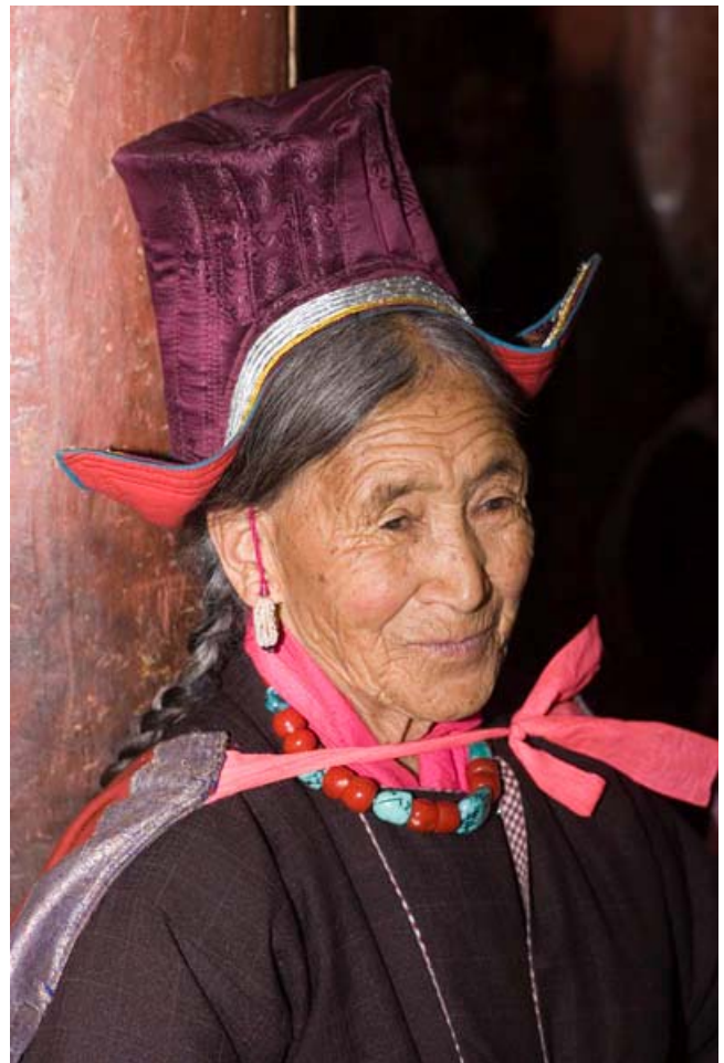
Traditionally dressed Ladakhi woman, Hemis Festival.