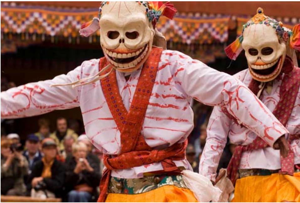
Cham dance, Hemis Festival.