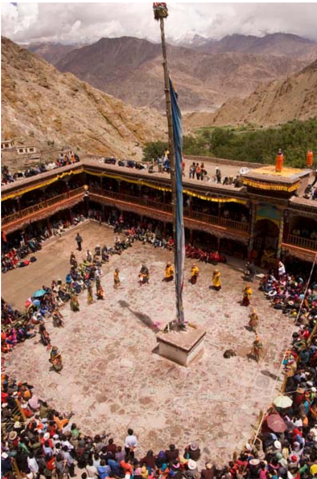
Cham dance, Hemis Festival.