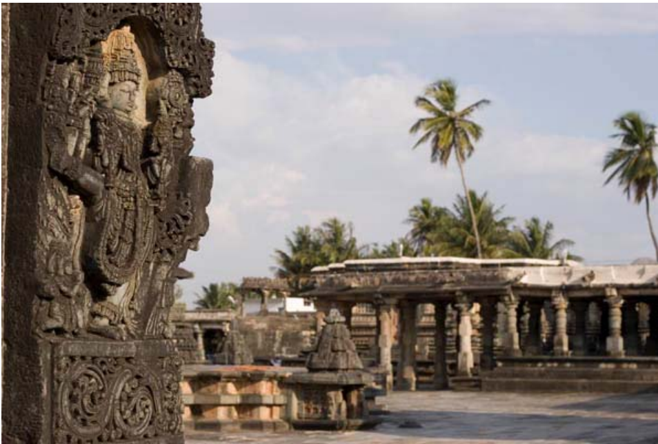
Channekeshava Temple, Belur.