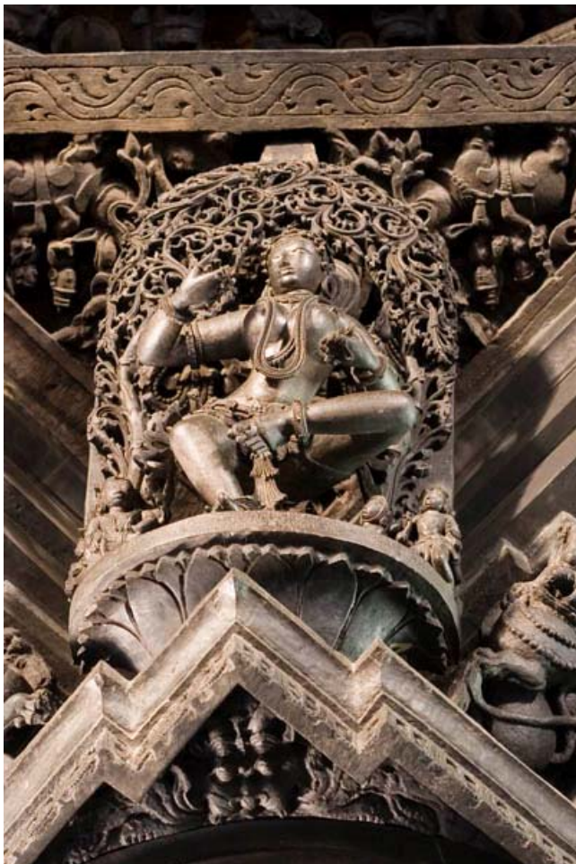
Interior of 12 th century Channekeshava Temple, Belur.