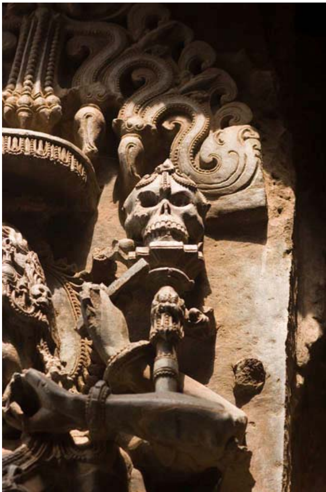
Detail on the 12 th century Hoysalewara Temple, Halebid.