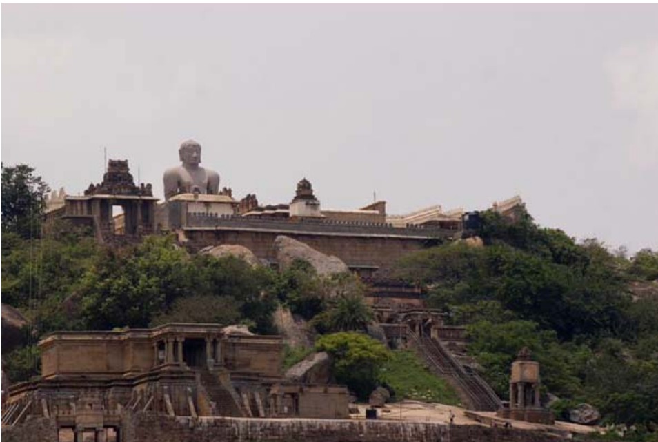
View of Vindhyagiri Hill and the Jain statue of Gomateshvara, Sravanabelagola.