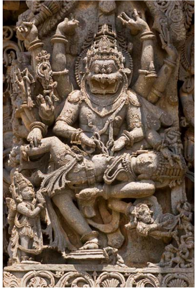
Vishnu incarnated as Narasimha (half man half lion), Hoysalewara Temple, Halebid.