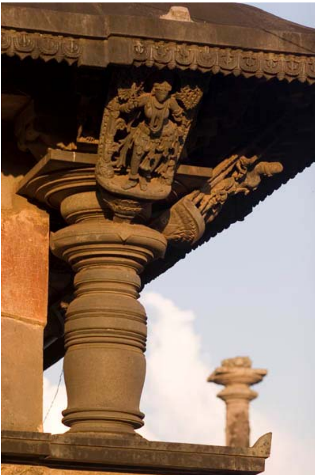
Channekeshava Temple, Belur.