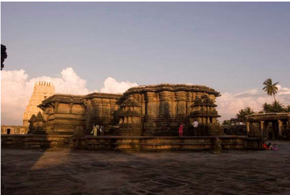
Channekeshava Temple, Belur.