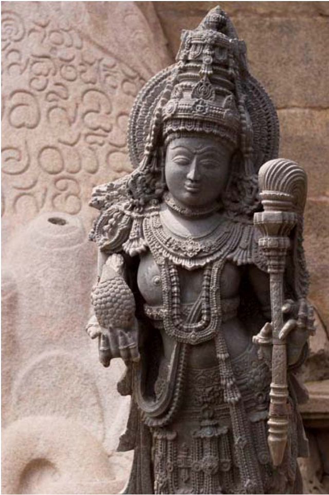
Figure next to the Jain statue of Gomateshvara, Vindhyagiri Hill, Sravanabelagola.