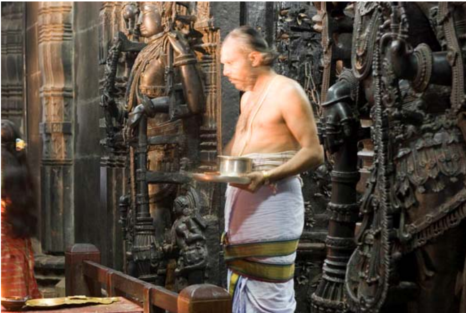
Priest in the 12 th century Channekeshava Temple, Belur.