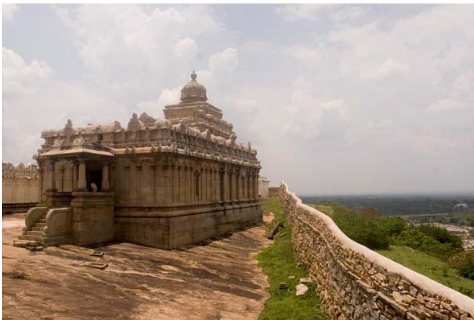
Jain temple on Chandragiri Hill, Sravanabelagola.