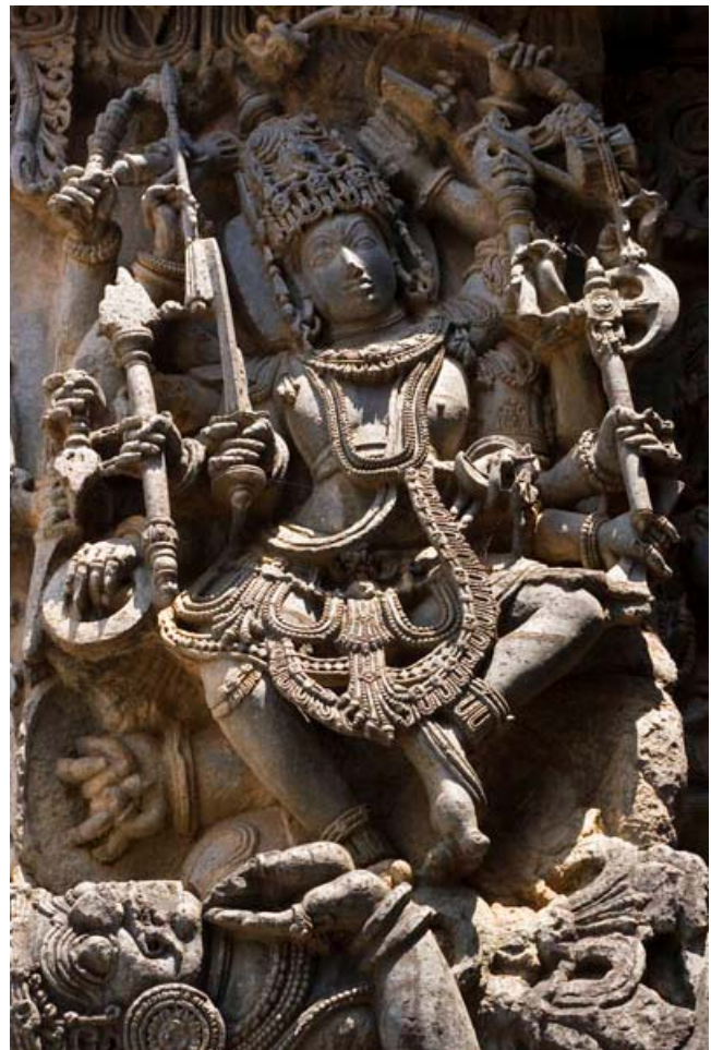
Detail on the 12 th century Hoysalewara Temple, Halebid.