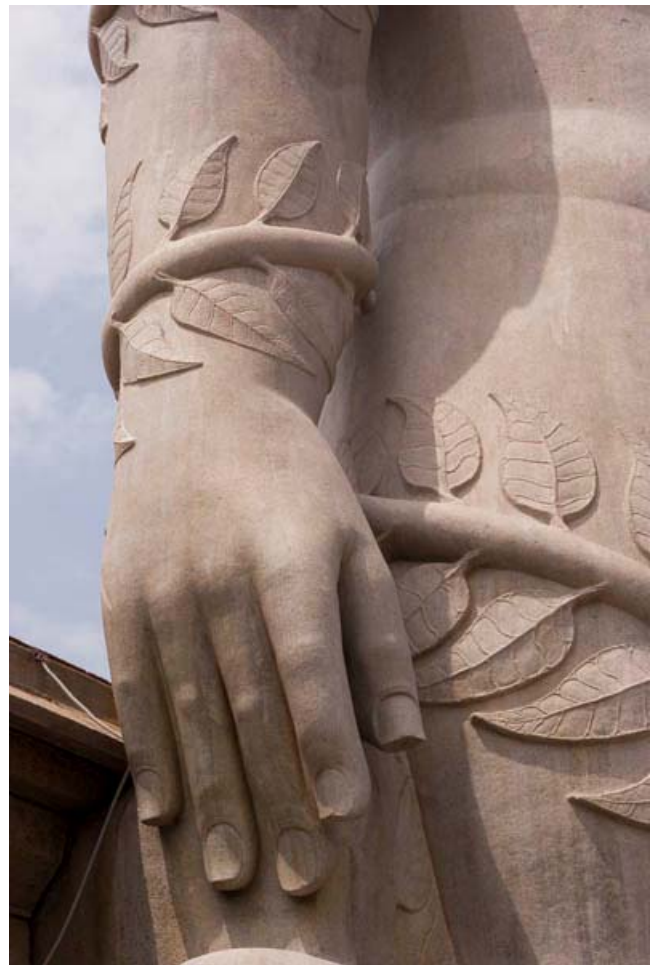
Monolithic 17.5 m (~60 ft) tall Jain statue of Gomateshvara, carved in 981 AD, Vindhyagiri Hill, Sravanabelagola.