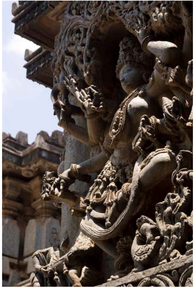
Detail on the 12 th century Hoysalewara Temple, Halebid.