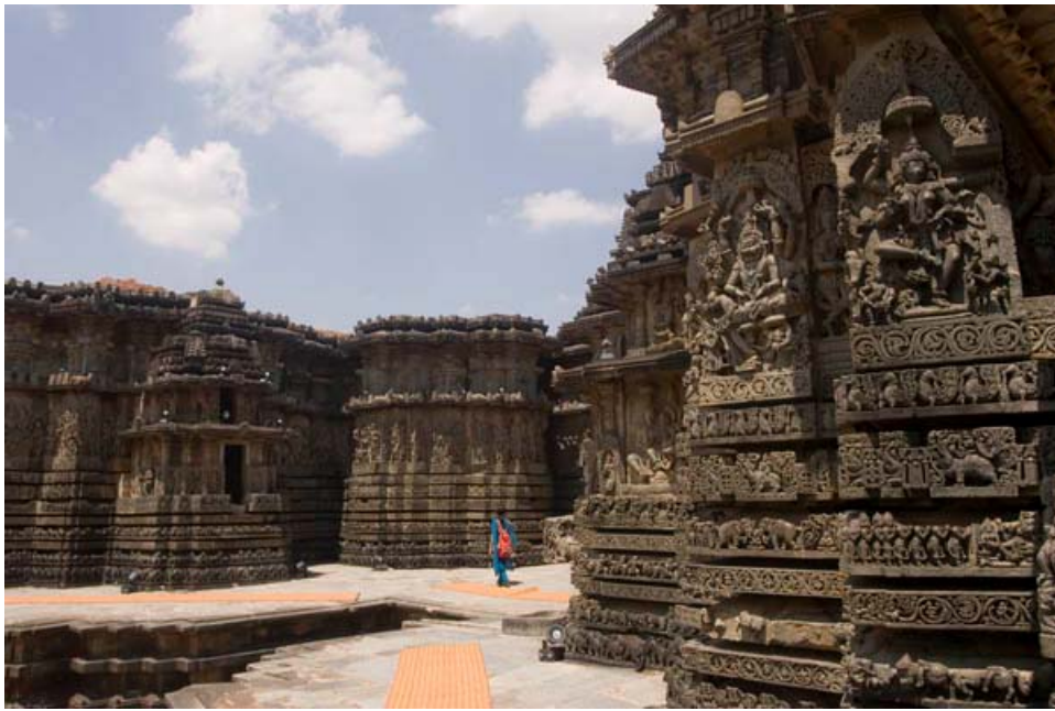
12 th century Hoysalewara Temple, Halebid.