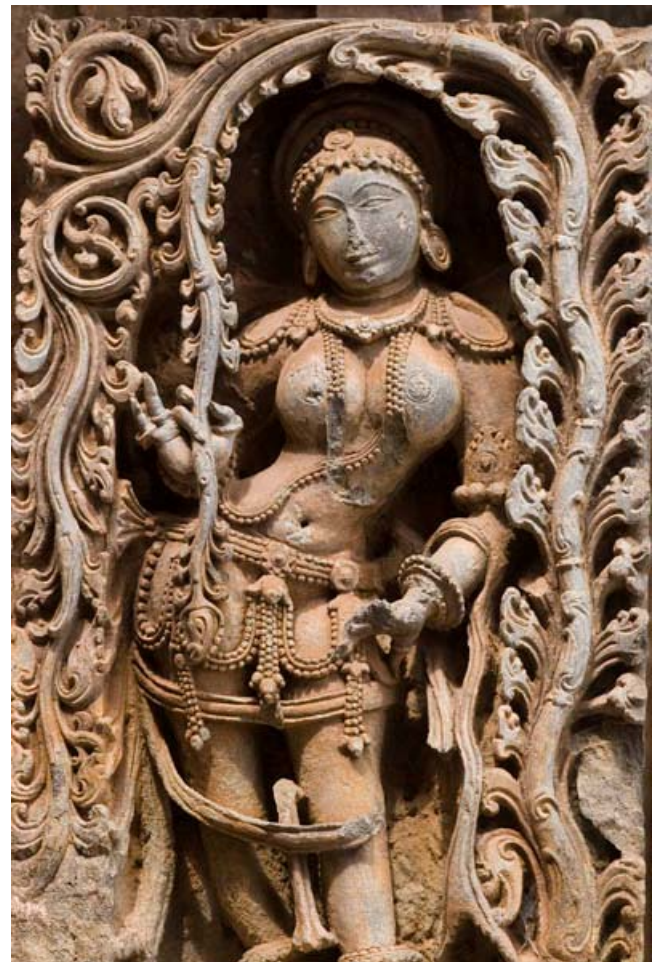
Detail on the 12 th century Hoysalewara Temple, Halebid.