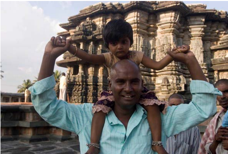
Pilgrim holds up little girl in front of the Channekeshava Temple, Belur.