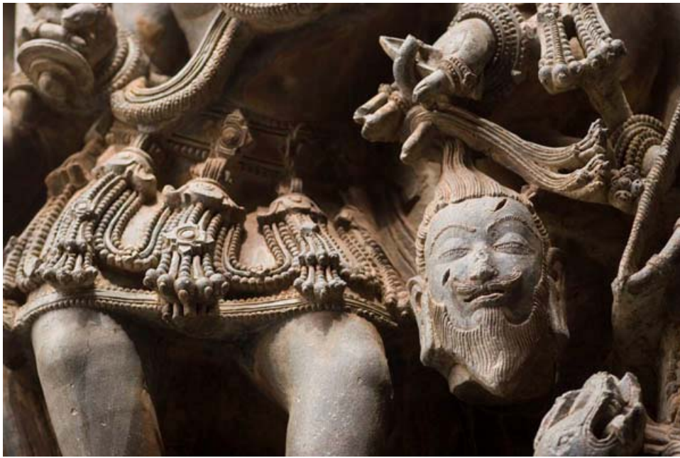
Detail on the 12 th century Hoysalewara Temple, Halebid.