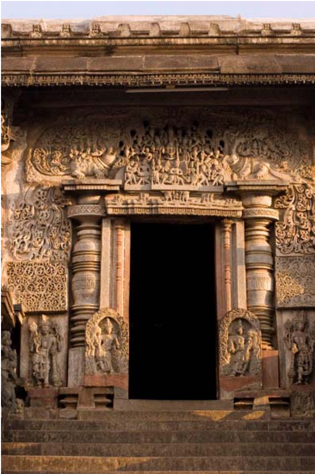
Channekeshava Temple, Belur.