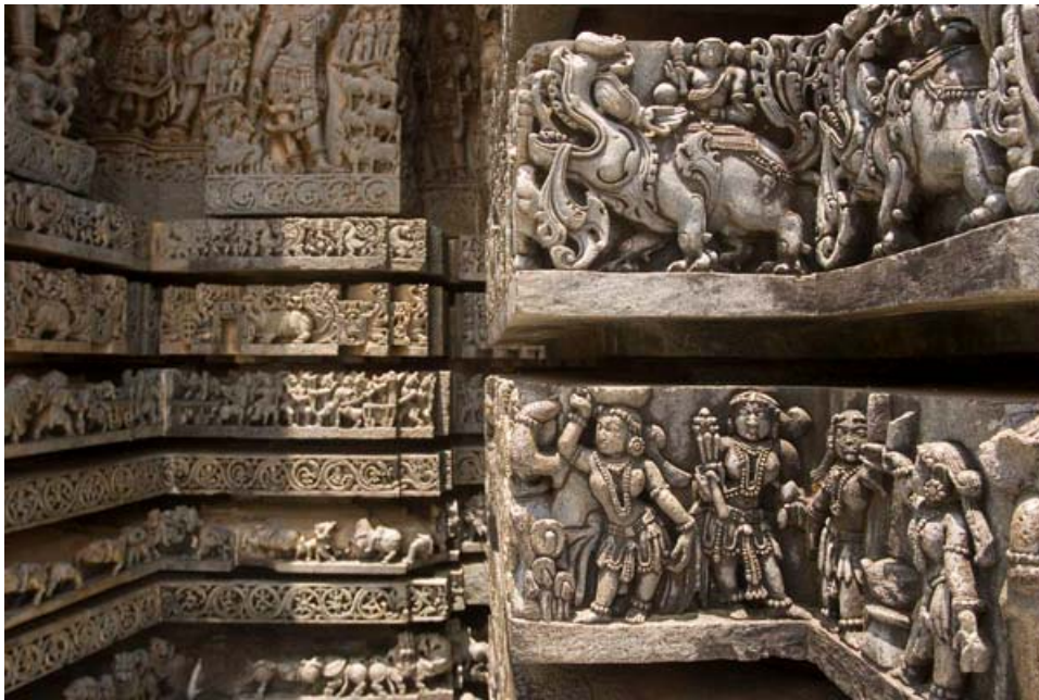
Detail on the 12 th century Hoysalewara Temple, Halebid.