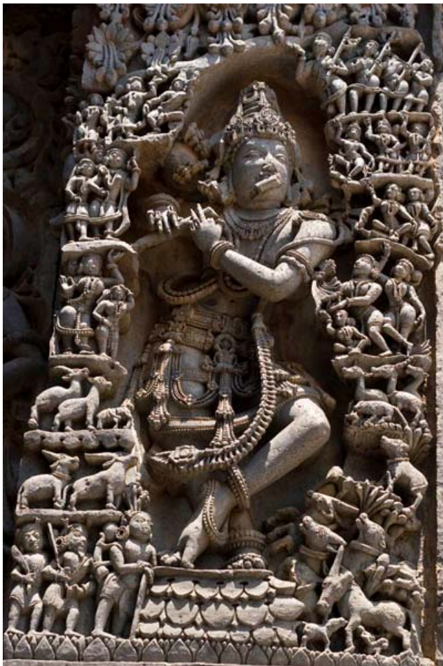
Detail on the 12 th century Hoysalewara Temple, Halebid.