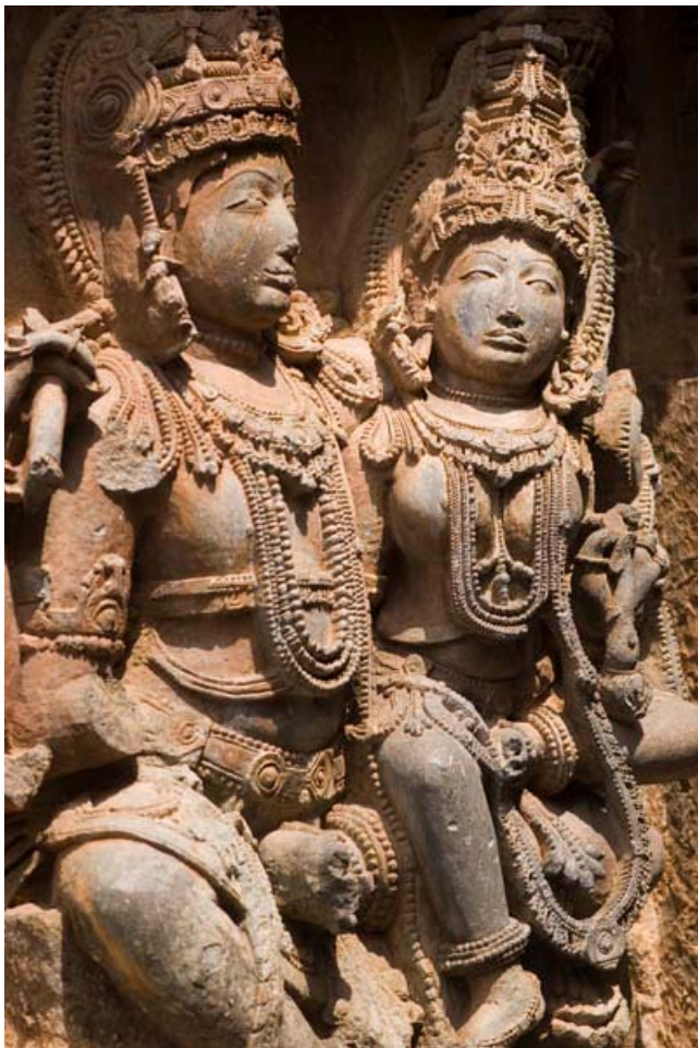
Detail on the 12 th century Hoysalewara Temple, Halebid.