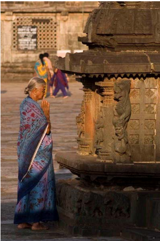
Woman praying in front of the Channekeshava Temple, Belur.