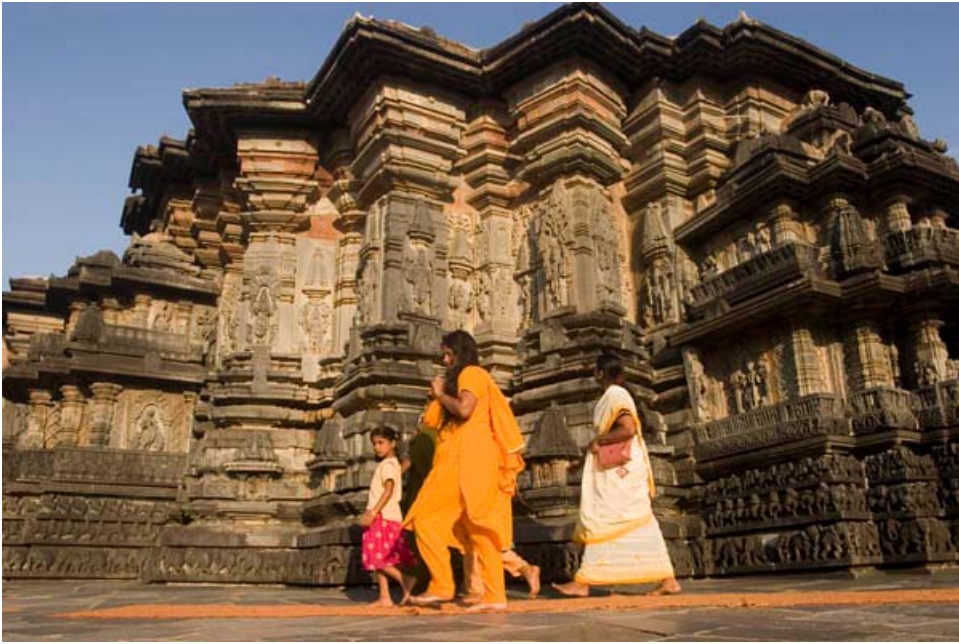
Channekeshava Temple, Belur.