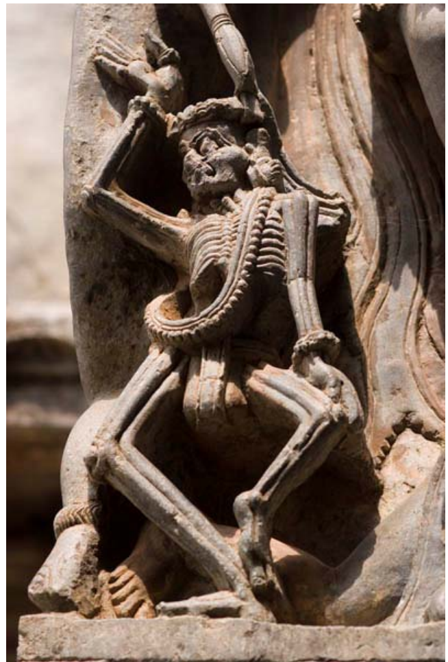
Detail on the 12 th century Hoysalewara Temple, Halebid.