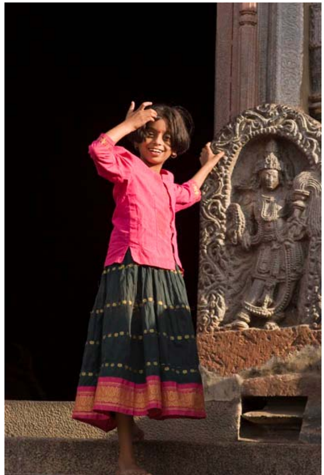
Little girl in front of the Channekeshava Temple, Belur.