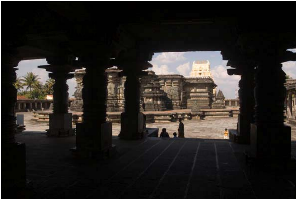
Channekeshava Temple, Belur.