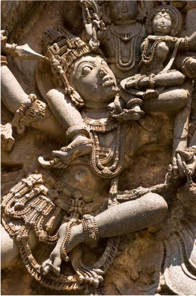
Detail, Hoysalewara Temple, Halebid.