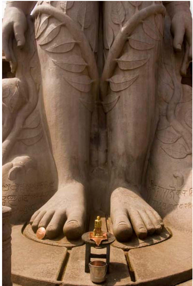
Monolithic 17.5 m (~60 ft) tall Jain statue of Gomateshvara, carved in 981 AD, Vindhyagiri Hill, Sravanabelagola.