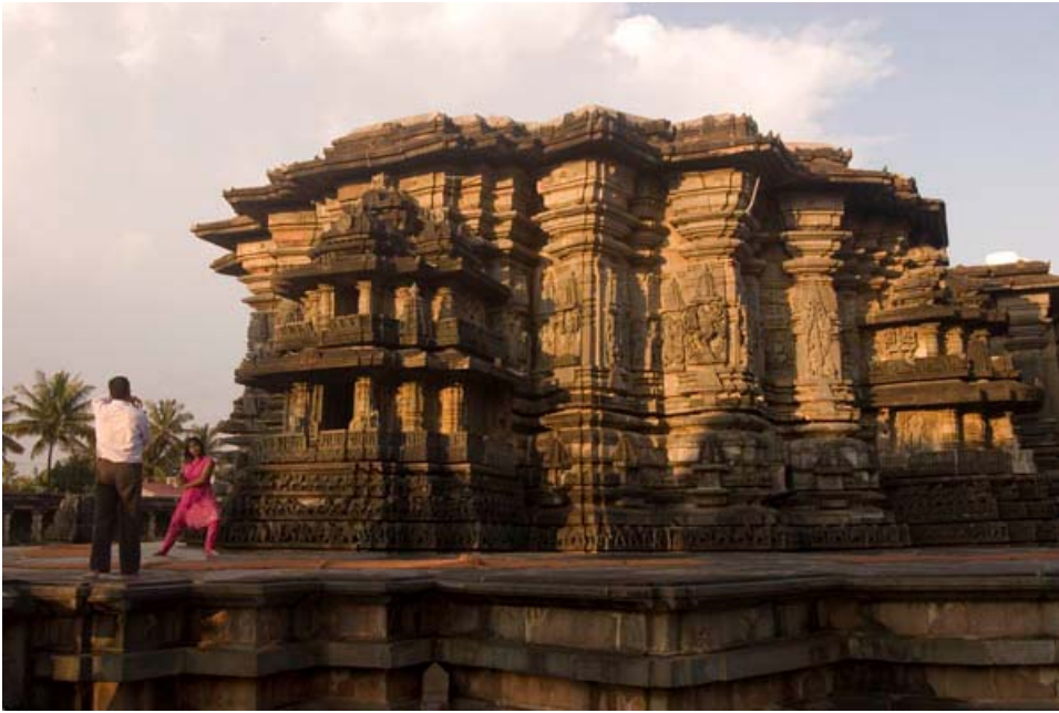
Channekeshava Temple, Belur.