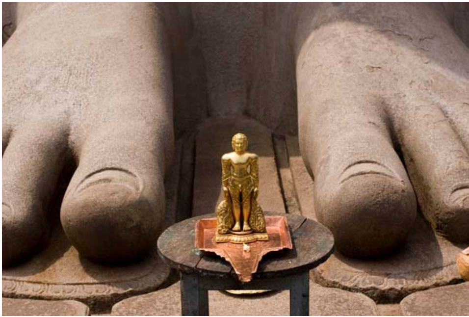
Feet of the Jain statue of Gomateshvara, Vindhyagiri Hill, Sravanabelagola.