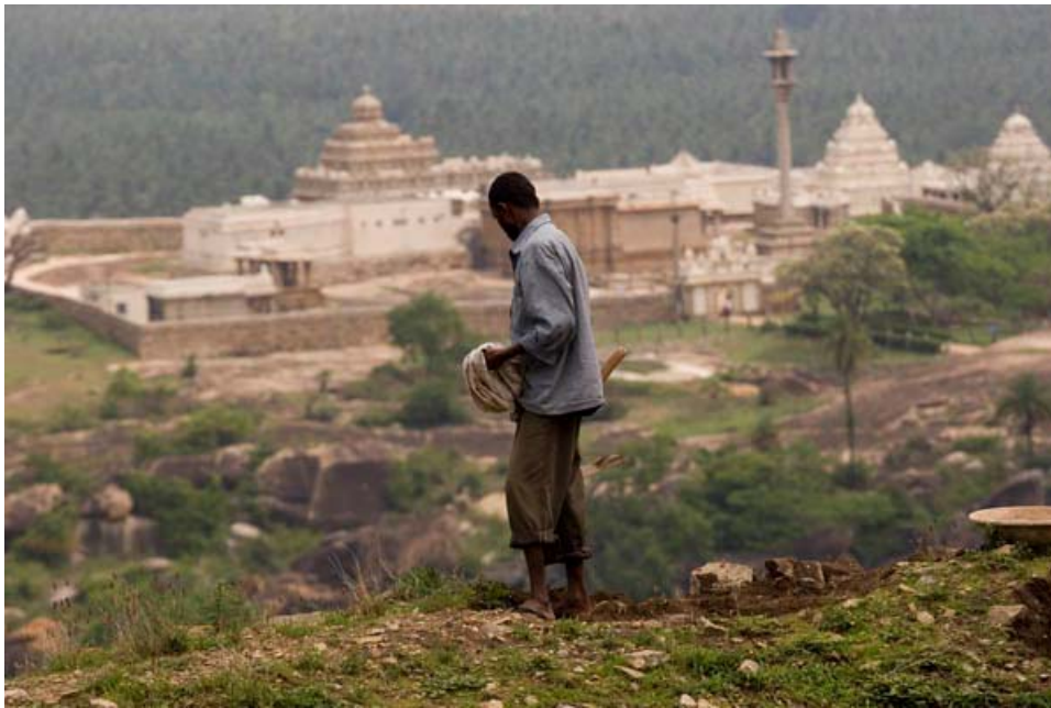
Looking towards the Jain temples on Chandragiri Hill from Vindhyagiri Hill, Sravanabelagola.