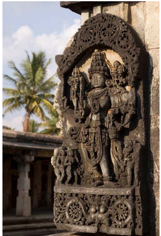
Channekeshava Temple, Belur.