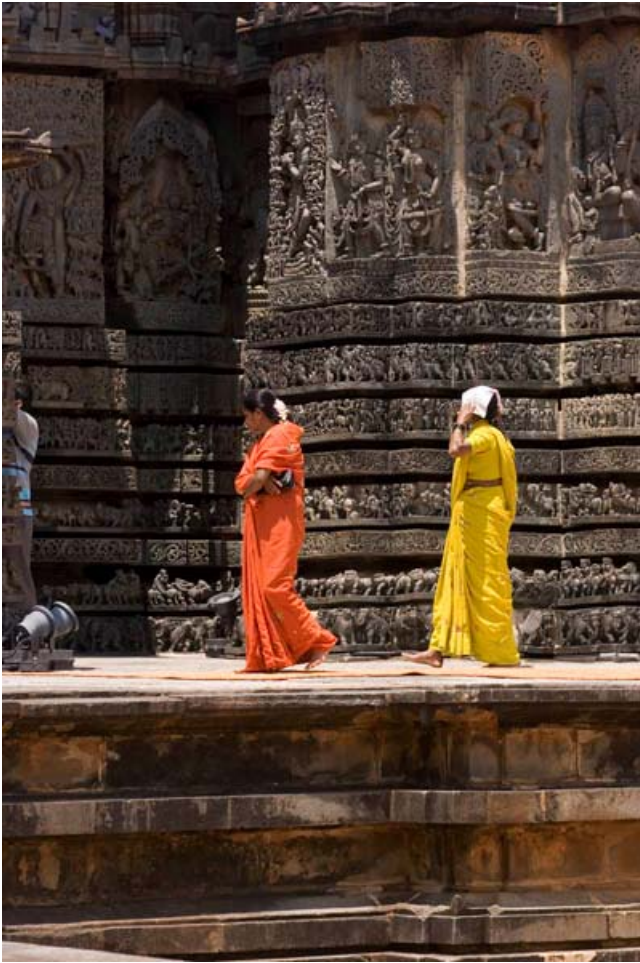
Hoysalewara Temple, Halebid.