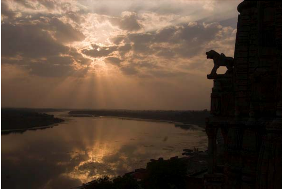
From the Vishnu temple by the river in K. Patan.