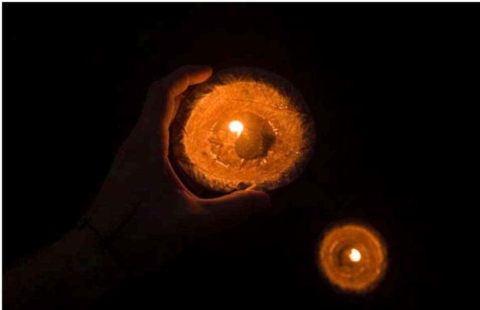
Setting a lamp in the river K. Patan.