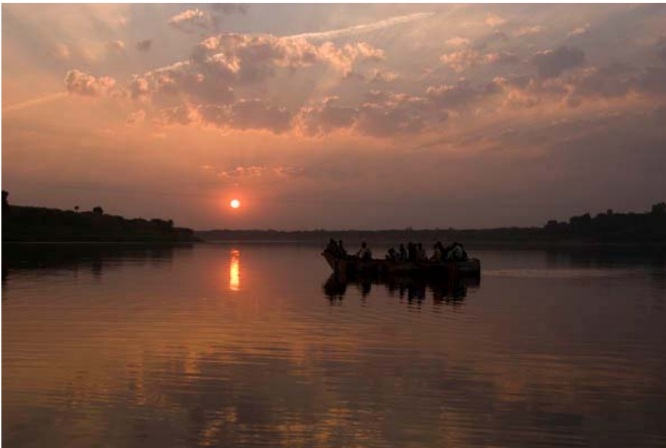
Sunset