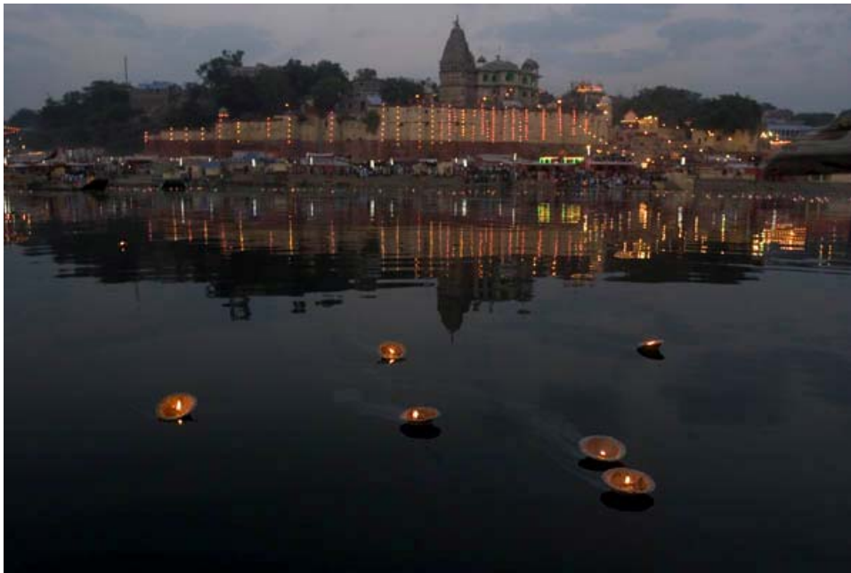
Ghee lamps floating in the river, K. Patan.