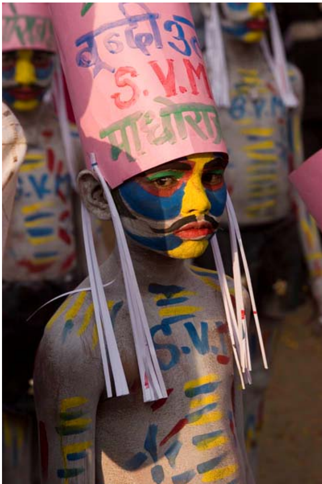
Parade in K. Patan

The Bundi festival extended to a few neighboring towns. The Rajastani tourist office in Bundhi was using the festival as an occasion to try to develop the tourist industry in these towns by organizing a free bus tour. I went along with 8 other tourists to town of Kashera Patan about 2 hours from Bundhi. I'm guessing nine foreign tourists were the most foreigners who had been in that town at one time since the British left. At least that is the way the locals seemed to act, as we became much more of an attraction than the festival. It probably helped the celebrity factor that a number of the other foreign tourists were blond white women. In any case we developed a mob of mostly kids and young men following us and had to have literally a police escort to keep the crowd of onlookers at bay. The town is on a river and we were taken out on a sunset boat ride, to escape the crowds, and watch the deepan from the water.