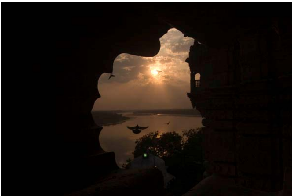
From the Vishnu temple by the river in K. Patan.