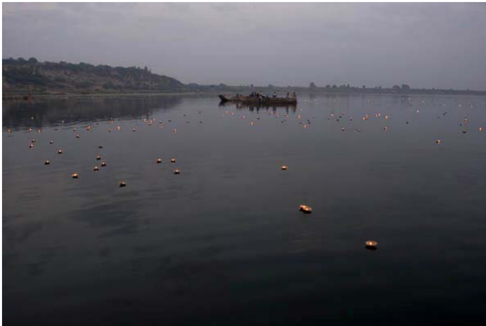
Lamps floating in the river K. Patan.